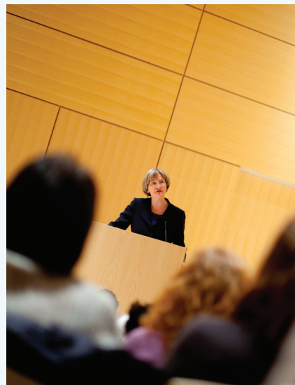
Harvard President Drew Faust presents a lecture titled "Telling War Stories: Reflections of a Civil War Historian" at the Cambridge Public Library, one of many programs offered in collaboration with Harvard.