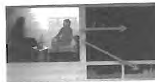
Fig. 6. Frame-to-frame head movements for both participants of a psycho-therapeutic dyad are converted into an amplitude graph. Data from Ramseyer & Tschacher, 2006.

Previous studies of synchrony in psychology predominantly relied on observer ratings. Contemporary multimedia technology, however, makes computerized quantification of movement increasingly accessible. Computer-based systems eliminate several of the problems commonly encountered when assessing nonverbal behaviour by means of observer ratings, especially the high costs (behavioural observation is time-consuming) and the low objectivity of rating procedures.