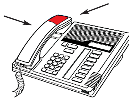
Norstar or EBS Telephone Set

Place sticker under handset earpiece or on top of handset