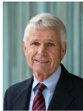
THOMAS PLACE Legal education is more than classroom instruction. It is a shared experience in which faculty and students work together to create and maintain a supportive climate for learning.