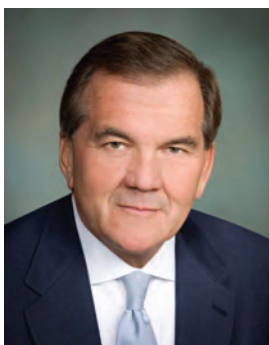
GOV. TOM RIDGE '72 CEO, Ridge Global, LLC; First Secretary, U.S. Department of Homeland Security; Former Governor of Pennsylvania

Dickinson Law provided me with an excellent legal education taught by a talented, supportive, and engaged faculty. My education prepared me well for law firm practice as well as working in-house for a global company.