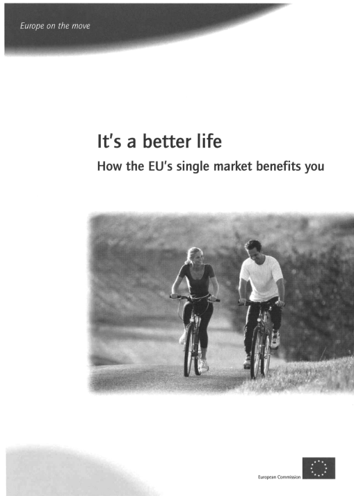
Figure 2: Advertising easy living.