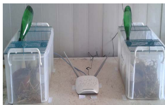
Figure 1: The experimental design.

Determination of catalase (CAT) activity: Catalase activity was measured using Biodiagnostic Kit No.CA 25 17 which is based on the spectrophotometric method described by Aebi (1984) [18]. Briefly, the catalase reacts with a known quantity of hydrogen peroxide and the reaction is stopped after 1 min with catalase inhibitor. In the presence of peroxidase, the remaining hydrogen peroxide reacts with 3, 5-Dichloro-2-hydroxybenzene sulfonic acid (DHBS) and