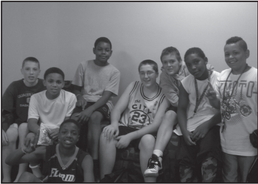
Meet new friends!