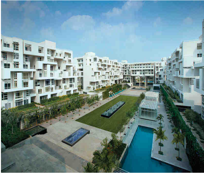
Figure No.2: 3D view of Rohan Laher 2, Baner, Pune

At Present "Hirashree Lake City" is the biggest Township in Kolhapur near Rankala Lake. Aesthetically spread over 7.5 acres of land, this project full of grandeur is an outcome of Shree Builders and Developers' successful journey of 21 years. This township with 8 towers and 24 twin bungalows is all set to be a charming feather in Kolhapur's cap. The organization is awarded with ISO 9001-2008. The Company is known for its quality construction, standards and also for its ethics, transparency, reliability, professionalism and reflexivity