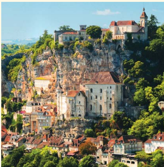
Rocamadour has beckoned travelers and pilgrims alike to its summit above a tributary of the Dordogne River.

Carved beneath a cliff overlooking the picturesque Vézère River, the prehistoric troglodyte village and UNESCO World Heritage site of La Madeleine offers unique insight into the Magdalenian culture, which prevailed in southern Europe for over 60 centuries from 15,000 to 9000 B.C. This ancient settlement of approximately 20 dwellings once accommodated 100 residents at a time.