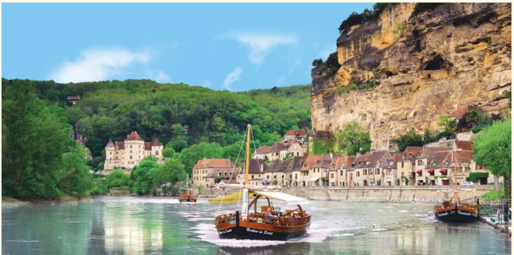
Sail the bucolic Dordogne River aboard a traditional 19 th -century wooden gabare, the typical mode of transportation of the Périgord region for more than 150 years.