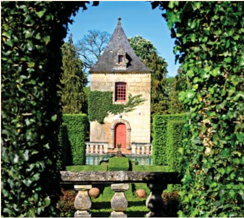
Admire the finest “English” gardens in France as you stroll through the enchanting grounds of Eyrignac Manor.