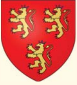
Dordogne Coat of Arms

Experience firsthand the true character and traditions of Dordogne during this comprehensive, small group travel program. It features the beautiful départements and countryside of southwestern France, the medieval village of Sarlat-la-Canéda within the oak-forested Périgord Noir and the world's largest collection of magnificent prehistoric art. Enjoy an enriching travel experience like no other; become immersed in the rhythm of daily life in Dordogne by interacting with local people; explore the history, culture, art, language and cuisine—and unpack just once! This comprehensive program is one of the popular VILLAGE LIFE® series, an intimate travel experience at just the right pace.