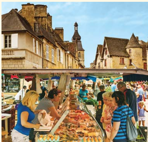
Experience Sarlat-la-Canéda's twice-weekly market, a medieval tradition in the heart of the village.

CULTURAL ENRICHMENT: Guided excursion to see L'Abri du Cap-Blanc's prehistoric cave friezes.