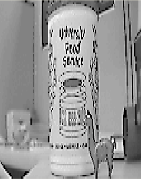
Fig 1. Input image of low resolution