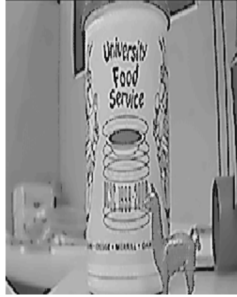
Fig 2. Output image of high resolution