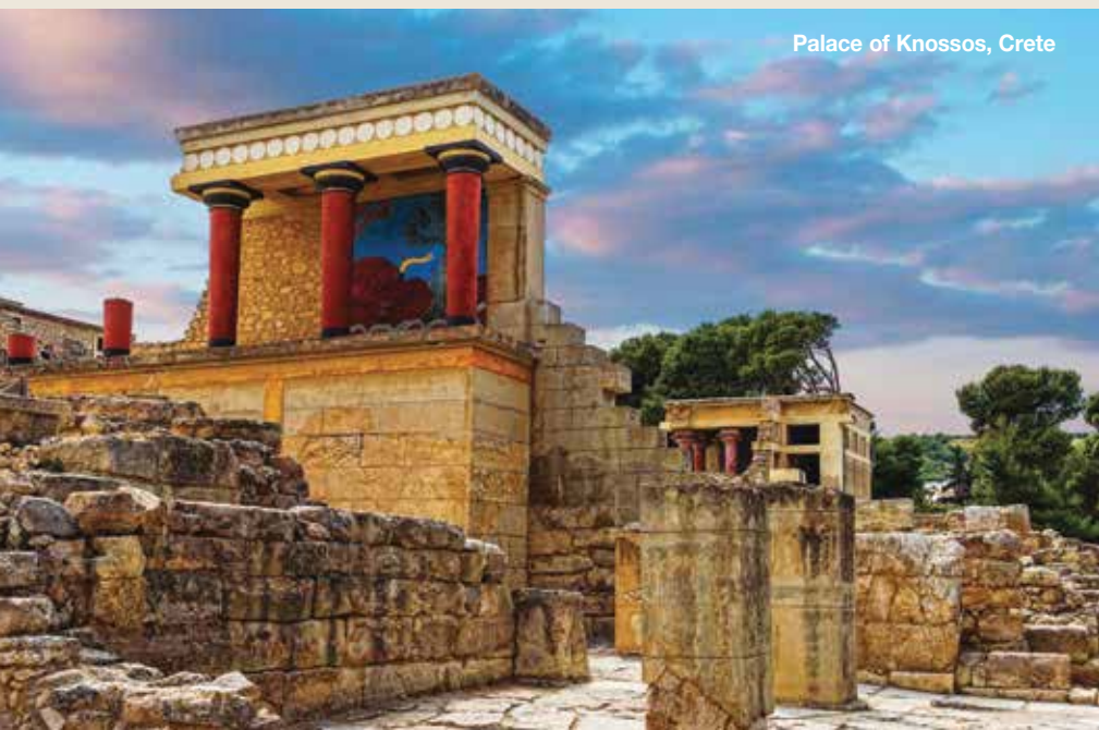
Palace of Knossos, Crete