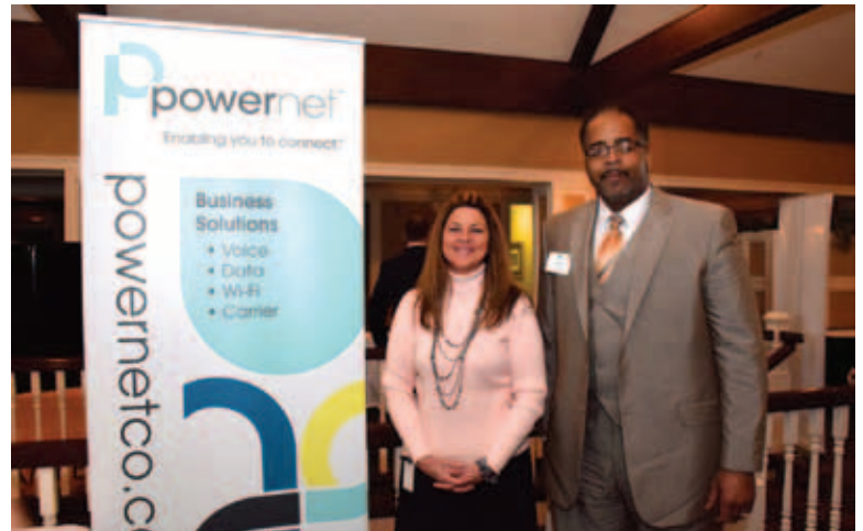
SPONSOR – Powernet