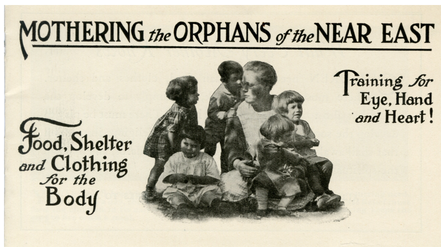
"Mothering the Orphans of the Near East," n.d., MRL 2: The Near East Relief Committee Records, series 2, box 18, folder 18.

one's view of the missionaries and their projects, they created, gathered, and maintained a unique and far-reaching record of people and places that in many cases would not otherwise exist, one which is of undeniable scholarly value in understanding the histories of the places they lived and worked, often for several generations.