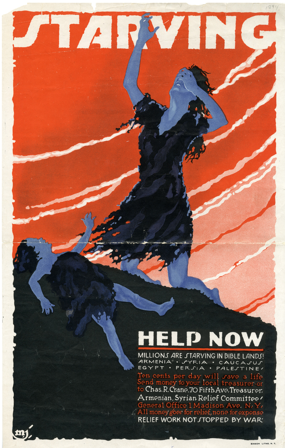
["Starving Armenia" poster], ca. 1915, Mission Research Library Pamphlet Collection, Armenian and Syrian Relief, folder 1894.

The Burke Library at Union Theological Seminary, one of Columbia University's Libraries, is home to the Missionary Research Library (MRL), an extensive and rich group of collections of primary and secondary source materials integral to understanding and interpreting the history, goals, significance, and legacy of missionaries in the nineteenth and twentieth centuries, including their role in documenting and responding to the Armenian genocide.