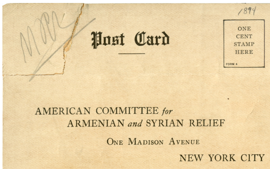
[Postcard], n.d., MRL 2: The Near East Relief Committee Records, series 2, box 18, folder 18.

120th Street and Broadway. Thanks to the stewardship of librarians such as Charles H. Fahs and Hollis W. Herring, the MRL continued to grow despite financial constraints. The library's minimal funding did eventually run out in 1976, at which time its collections were transferred to the Burke Library (Frame, 1998). What is referred to today as the MRL collections include 564 linear feet of archives of missionaries' papers and institutional records, hundreds of printed books, and more than 21,000 pamphlets. All of this material has been processed, and is available through CLIO, Columbia's online catalog, and through the library's archival finding aids. Taken as a whole, the MRL collections form a remarkably comprehensive record of missionary work in education, politics, philanthropy, health, and related fields, and of the places in which that work was conducted over the course of the nineteenth and twentieth centuries.