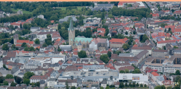
Juli 2014