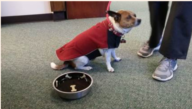
Zoey with water bowl provided at Roswell Visitors Center