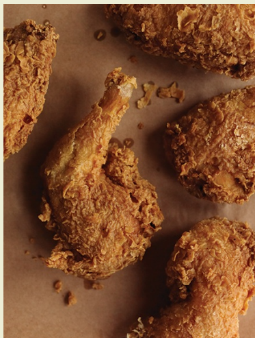
Table & Main was selected for its fried chicken. Chef Holly Chute who chose the Top Ten dishes, stated that it is the quality of the chicken along with the crispy, crunchy crust that makes it a "Top Ten" winner.

The Guide features 100 Plates Locals Love . It covers each region of Georgia to find the best local dishes recommended by tasters from across the state.