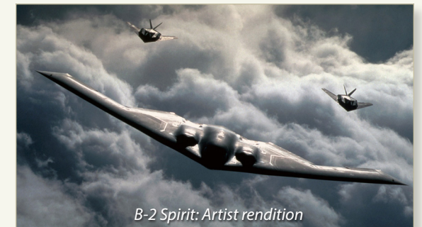
B-2 Spirit: Artist rendition