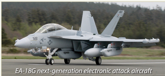
EA-18G next-generation electronic attack aircraft

Service obligation starts upon completion or withdrawal from the Program and is served concurrently with any other service obligation. All students must submit a signed Participation Agreement prior to enrolling in the program.