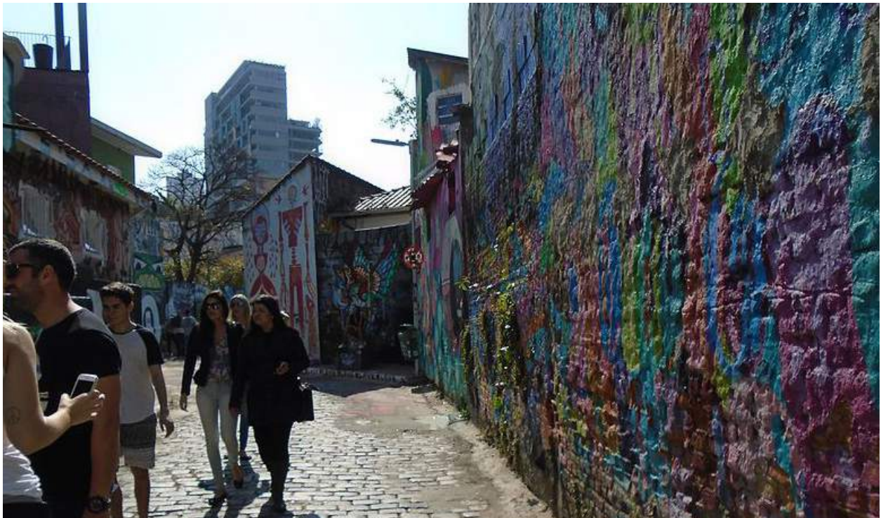
Batman Alley: The nickname for the area is attributed to a graffito of the DC Comics character Batman which was painted on one of the walls in the 1980s.