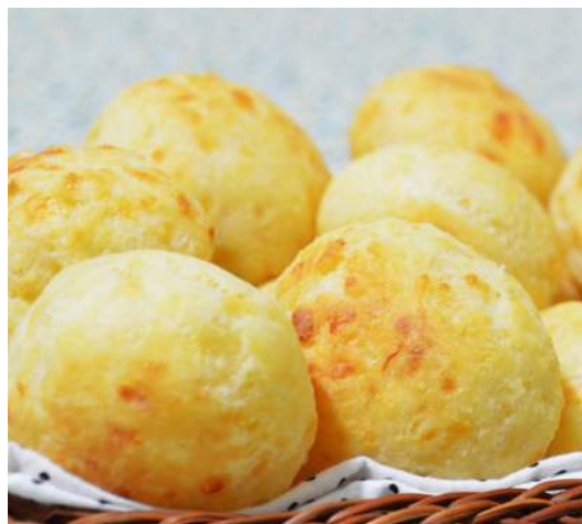
Pão de queijo