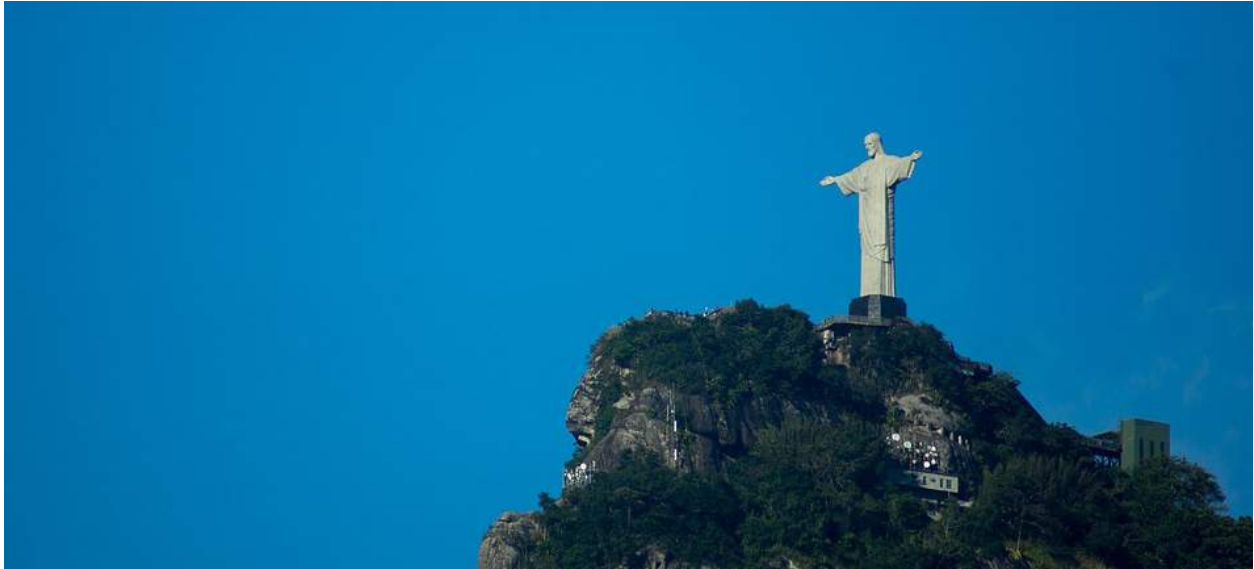
Christ the Redeemer: An Art Deco statue of Jesus Christ in Rio de Janeiro, Brazil, created by French sculptor Paul Landowski and built by the Brazilian engineer Heitor da Silva Costa, in collaboration with the French engineer Albert Caquot.

Rio de Janeiro is a large seaside city in Brazil, which is famous for its Copacabana and Ipanema beaches, Christ the Redeemer statue atop Mount Corcovado and for the Sugarloaf Mountain. In February, its Carnaval festival, features parade floats, flamboyant costumes and samba dancers, and is considered the world's largest.