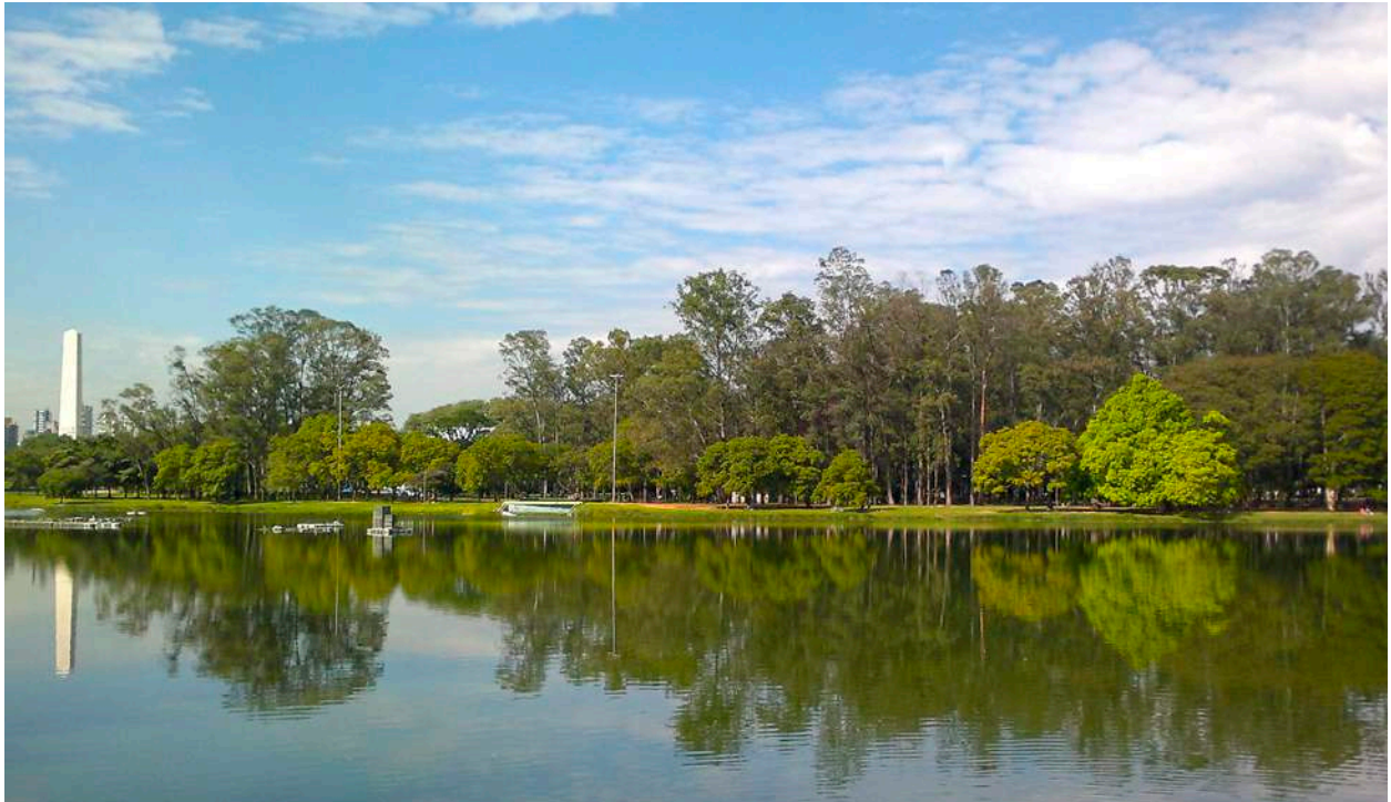
Ibirapuera Park: An urban park in São Paulo. It comprises 158 hectares.