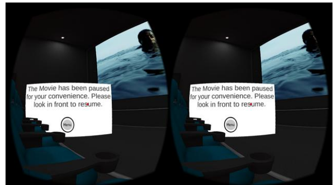
Figure 2 - When the user stops viewing the screen, the movie is paused and as soon as he is watching it again, the movie is resumed and the pause hovering card goes away. This card can also be used to open the "remote control menu"