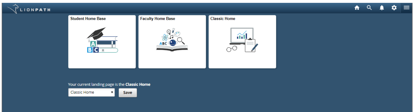
Figure 1: The Home Base Launcher page

If you have more than one role in LionPATH, e.g., student and faculty, when you initially sign in you will see the Home Base Launcher.