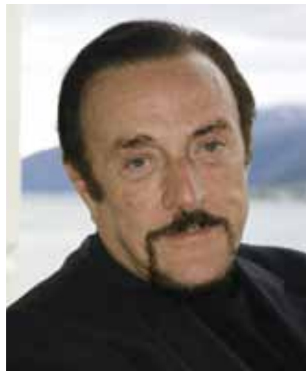
Series host Philip Zimbardo

Innovative applications in the areas of human factors, law, and conflict negotiation.