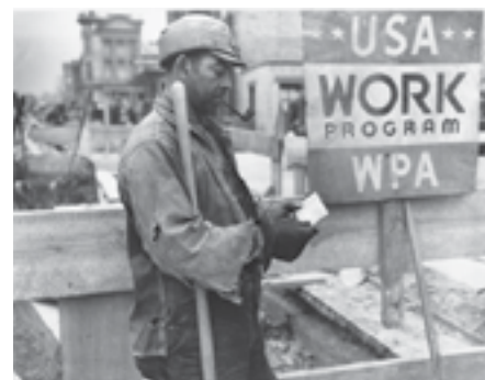
Works Progress Administration Worker Receiving Paycheck, 01/1939.

Farmers lured into producing massive food surpluses for WWI could no longer profit when the war ended and demand plummeted. After 1933, President Franklin D. Roosevelt sought to improve the conditions of farmers via policies in his New Deal plan. Later, the majority of government subsidies meant to help the struggling small farmer went to corporate agribusiness. The Freedom to Farm Bill of 1996 gave farmers a little more maneuverability, but for the most part farmers are still held to the fluctuating demand statuses of large competitive firms.