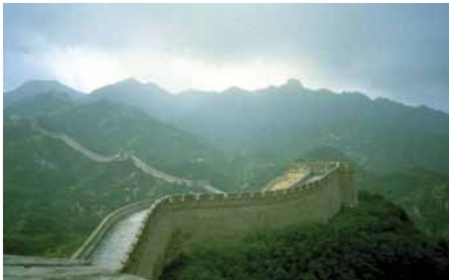
The Great Wall of China is the work of early complex and centrally controlled societies.