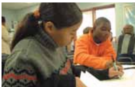
Mississippi students analyze problems associated with refugee camps in order to propose solutions.

This session explores problems of religious conflict and urban organization with a case study on Jerusalem as sacred space. It also looks at urban and agricultural use of scarce water resources by studying Egypt's Nile River. Classroom segments show students exploring the problems of refugee populations and engaging in a hands-on activity about the Nile River Delta. ▼