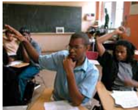
Senior comparative government students create a constitution for the hypothetical country of Permistan at Benjamin Banneker High School in Washington, DC.