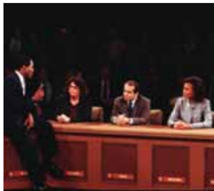
Public figures argue through ethical dilemmas.