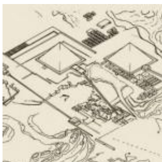
Figure 1 Khafre's funerary complex