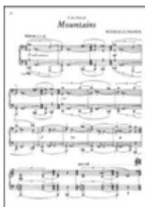
Figure 1 Mountains

Reproduce music notation as a figure. Pinpoint divisions as given in the score (e.g. page, movement, bar/s). Include online source details if citing a version of the score available online.