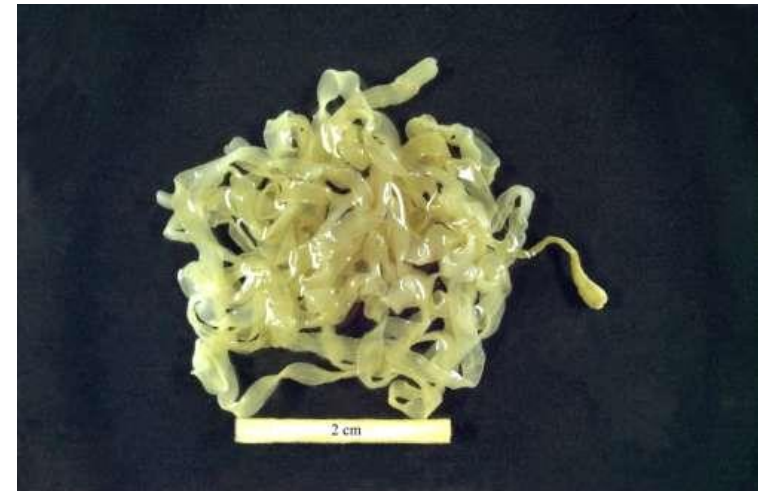
Figure 3. Larval tapeworms from a case of sparganosis (2009).

If you are reproducing an image/photo/diagram/graph or similar from a public source, you should cite and reference it in the format relevant to the source you took it from – e.g. a journal-format reference for a graph originally published in a journal article; a web-format reference for an anatomical diagram you found on the internet. For example, an image taken from the School's digital asset management system AssetBank might be cited as: