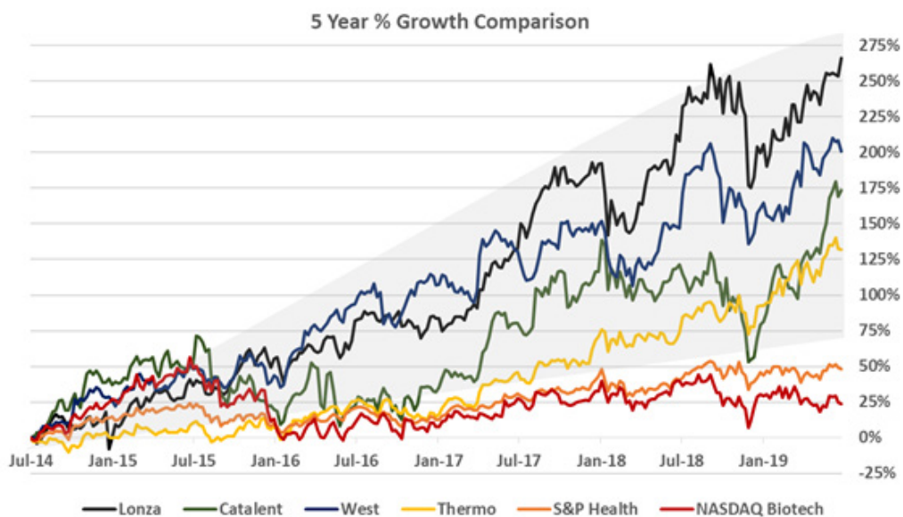
Exhibit: Select CDMO performance vs. S&P Healthcare and NASDAQ Biotech

Stock appreciation at these large CDMOs is out-pacing the broader Health and Biotech sector by 3-4x in the 1-year and 5-year timeframes. The average appreciation in these three CDMOs was 214% from July 2014* to July 2019, compared to 48% in the S&P 500 Health Care index, and 24% in the NASDAQ Biotech Index. In the past year, the CDMOs appreciated 21%, compared to 6% and -11%, respectively. (Source: Bloomberg)