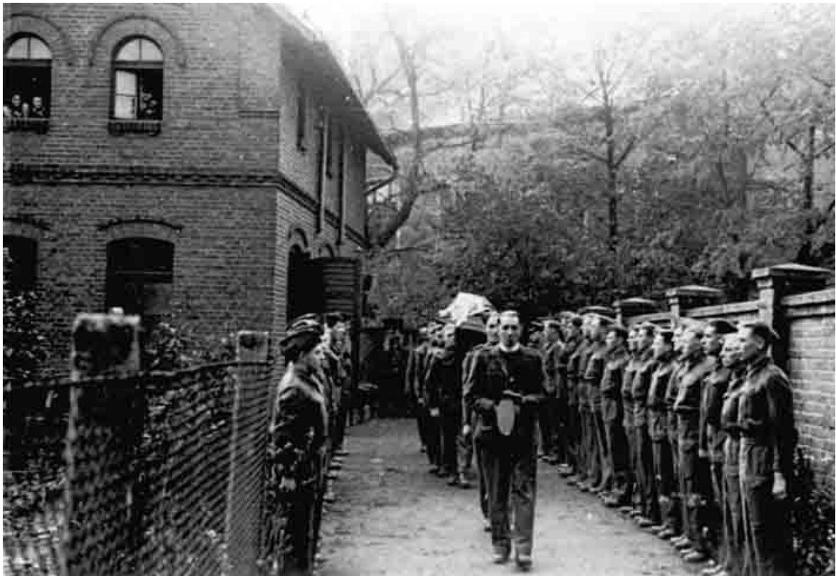
Prisoner of War Camp Stalag VIII B, Germany, 1942-3, from photographs collected by Sgt. Clin Thomas Power. Photographs Collection. Reader access file / P97-122.

Hocken Collections/Te Uare Taoka o Hākena 90 Anzac Ave, PO Box 56, Dunedin 9054 Phone 03 479 8868 reference.hocken@otago.ac.nz https://www.otago.ac.nz/library/hocken/