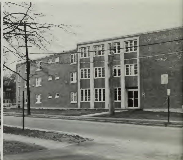
HAS WARMTH AND DIGNITY