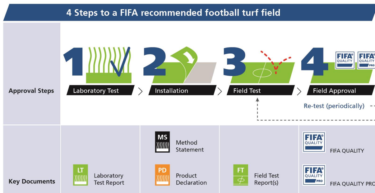
Figure 1: Approval process steps and the related documents / parties

The FIFA Quality Programme for Football Turf is dedicated to the certification of a particular field that has been found to fully meet the requirements of the Quality Programme. It is not the approval of products. To be certified, football turf fields must reach the performance and quality criteria established to provide the best possible playing conditions for either of the two specific quality levels. Consequently, each field must undergo four steps as highlighted below: