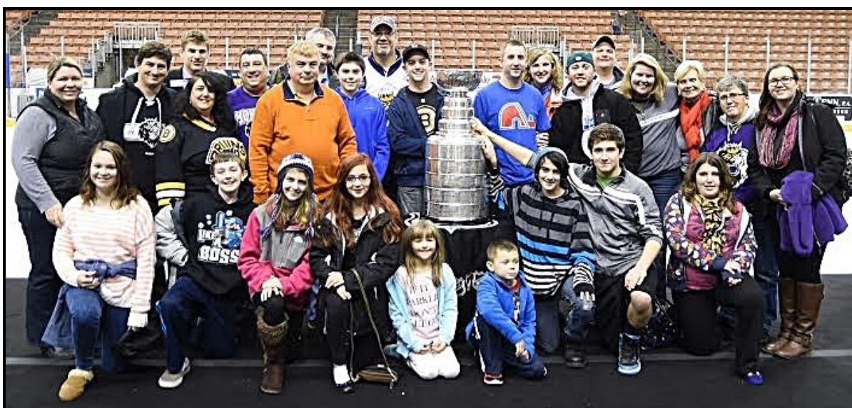
FAC members and friends with the Stanley Cup during the December 27th Monarchs-Bruins Game

Send this form plus payment (CHECKS OPTIONAL) to Franco-American Centre; 100 Saint Anselm Dr., #1798; Manchester, NH 03102 . For information on any item in this brochure, call (603) 641-7114 or visit www.facnh.com