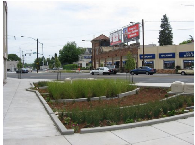
Figure 2. This bioretention area takes runoff from the street through a trench drain in the sidewalk as well as runoff from the sidewalk through curb cuts

A few municipal DOT programs have instituted green street requirements in roadway projects, but as of yet, specifications for street bioretention have not yet been incorporated into municipal DOT specifications. Many cities do have street bioretention pilot projects; two of the well documented programs are noted in the table. Several concerns and considerations have prevented standard implementation of bioretention by DOTs.