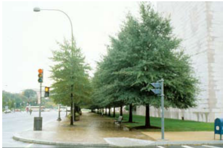
Figure 4. Trees planted at the same time but with different soil volumes, Washington DC

By providing adequate soil volume and a good soil mixture, the benefits obtained from a street tree multiply. To obtain a healthy soil volume, trees can simply be provided larger tree boxes, or structural soils, root paths, or “silva cells” can be used under sidewalks or other paved areas to expand root zones. These allow tree roots the space they need to grow to full size. This increases the health of the tree and provides the benefits of a mature sized tree, such as shade and air quality benefits, sooner than a tree with confined root space.