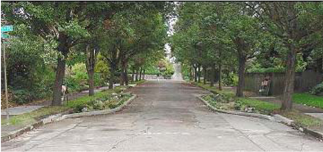
Figure 8: NE Siskiyou Vegetated Curb Extensions