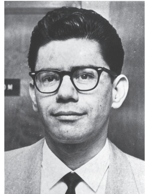
▲ Ernesto Miranda, shown here after a jury convicted him for a second time. Miranda was convicted on rape and kidnapping charges. Arresting officers did not advise him of his rights. His case led to the now-famous Miranda warnings. How do the Miranda warnings read?

On appeal, the U.S. Supreme Court rendered what some regard as the most far-reaching opinion to have affected criminal justice in the last half century. The Court ruled that Miranda’s conviction was unconstitutional because “[t]he entire aura and atmosphere of police interrogation without notification of rights and an offer of assistance of counsel [tend] to subjugate the individual to the will of his examiner.”