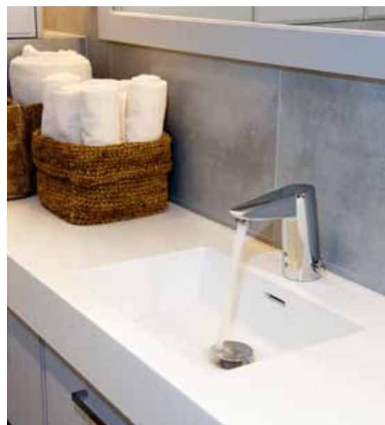
Touchless Oras Cubista – the most popular faucet in the fair.