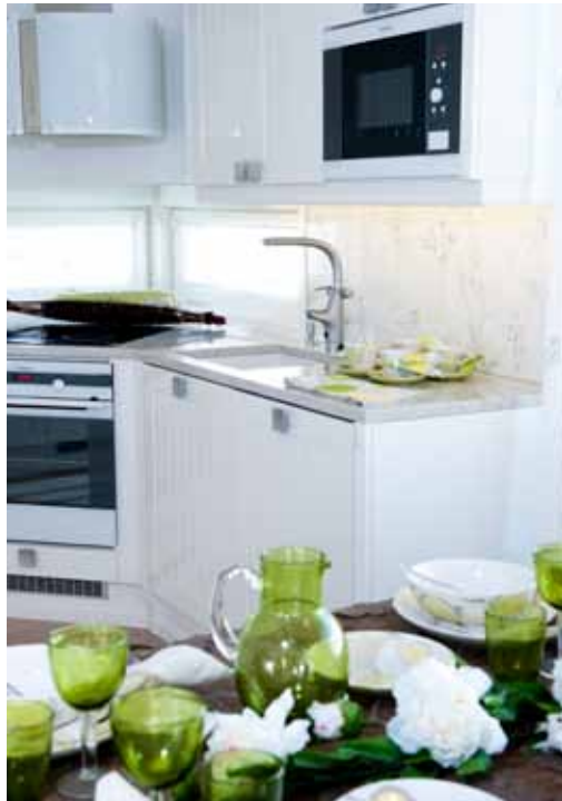
Oras Ventura 8025-60 with satin surface has become extremely popular design kitchen tool.