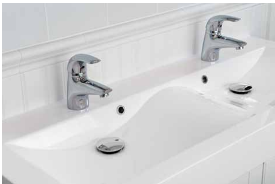
Two faucets in the bathroom and there's no rush in the mornings!

■ The fair presented the complete range of housing: city apartments for young, single adults and elderly people, small family homes and lavish dream homes. Additionally the fair showed solutions for senior housing. Altogether Housing Fair 2011 presented 131 homes: 30 houses, seven apartment buildings, two row houses and one semidetached. About 130.000 people visited the fair in sunny Kokkola. Visitors were impressed by the venue and praised the diversity as well as the quality of the houses. We collected some of the highlights on this page. ■