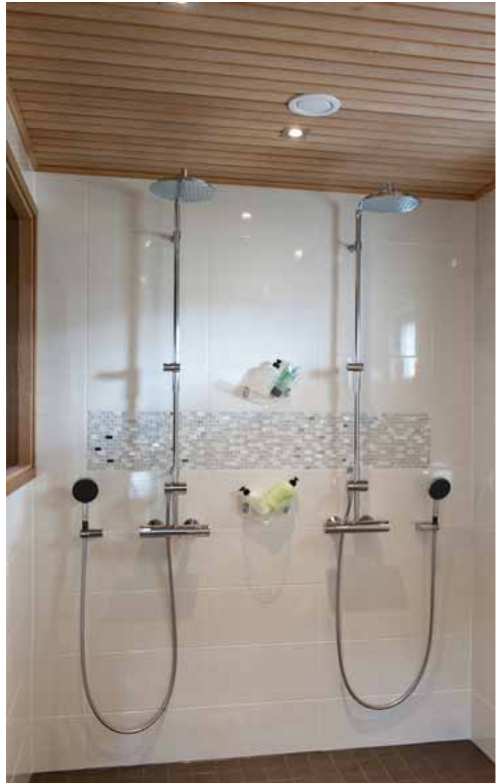
Combination of Oras Cubista thermostatic faucet and Oras Hydra shower set came on market last spring. The combination was widely presented at the fair.