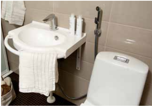
The designers have trust in smart faucets in senior homes: Oras Cubista touchless faucet on wash basin and Oras Eterna in the shower. Additionally Oras Ventura no 8025 – faucet with both single lever and touchless functions – in the kitchen.