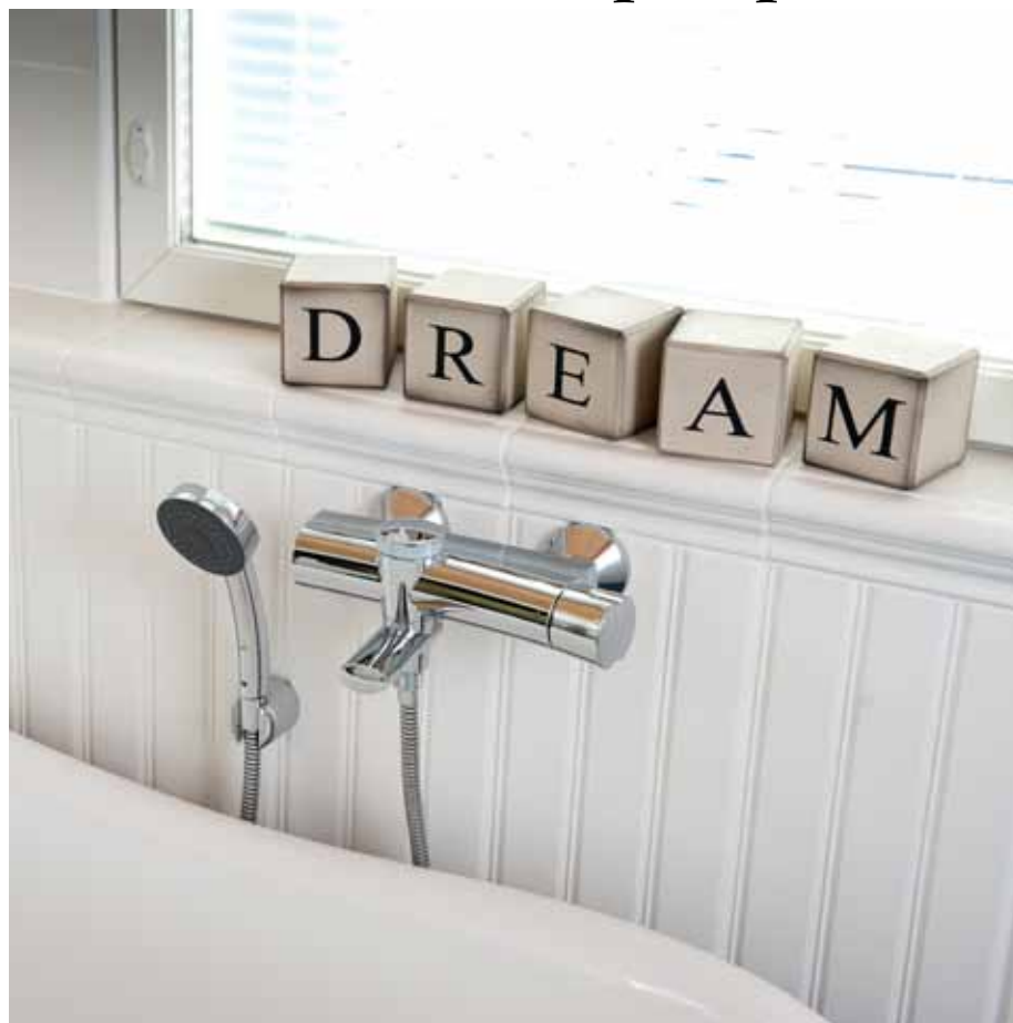
Oras Eterna faucets were lavishly presented in several bathrooms.

■ HOUSING FAIR 2011 IN KOKKOLA PROVIDED PLENTY TO SEE. THE THEME “HOMES OF ALL SIZES FOR PEOPLE OF ALL AGES” WORKED REALLY WELL. ■