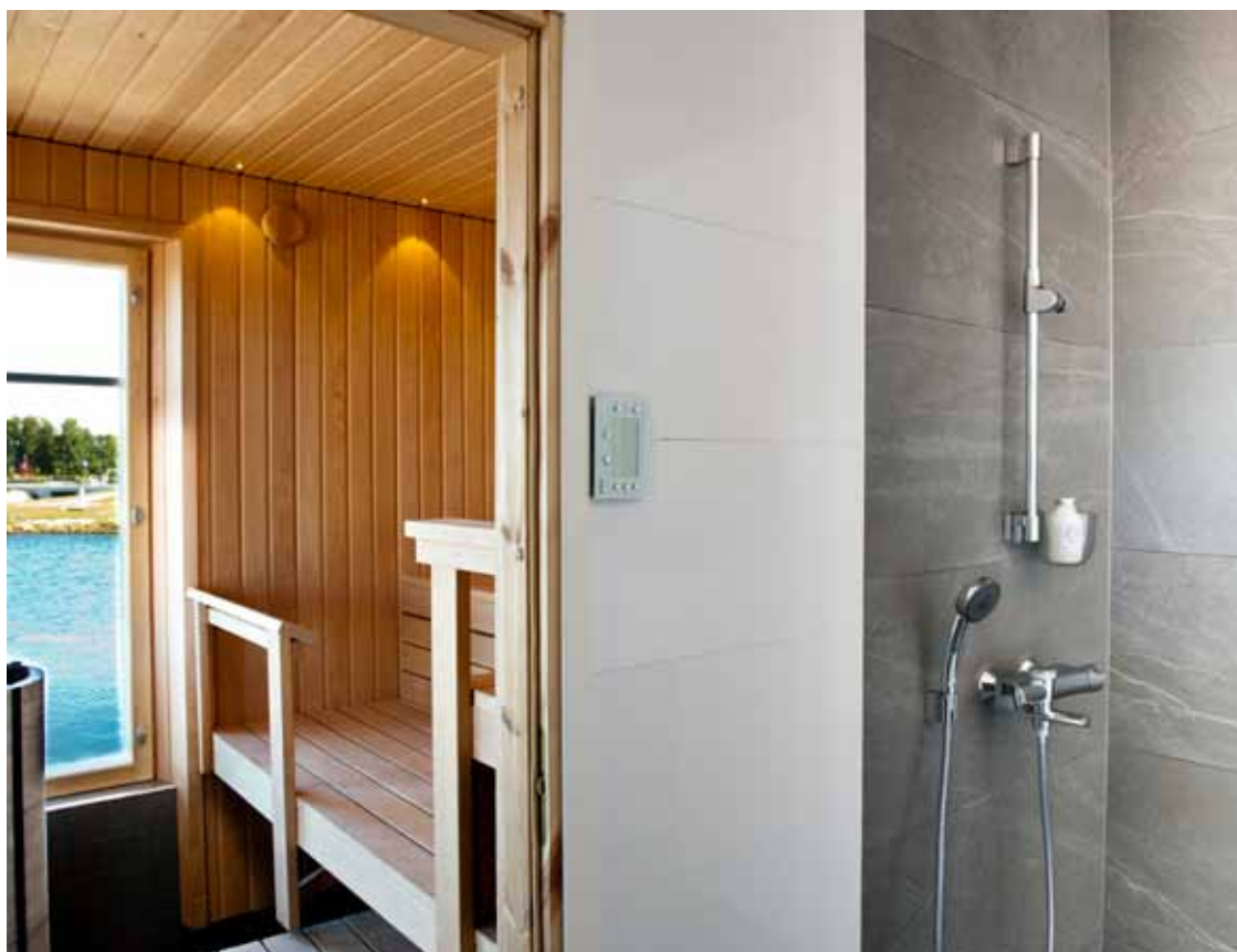
Smart use of water decreases household water and energy consumption and costs. In the picture: Oras no 6389 Oras Eterna with Oras Natura shower set.