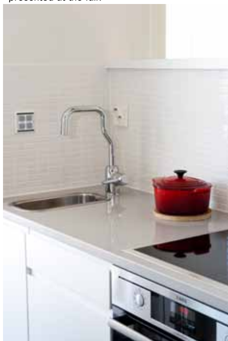
La Cucina Alessi by Oras saves steps as a second faucet in the kitchen.