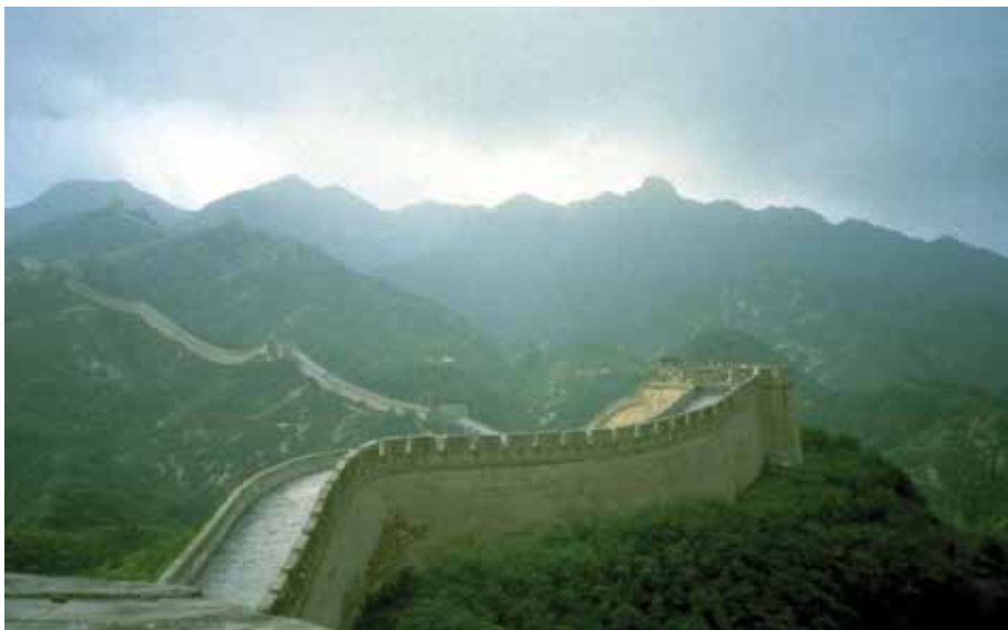
The Great Wall of China is the work of early complex and centrally controlled societies.