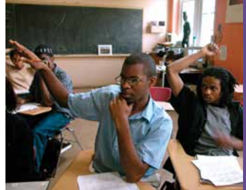
Senior comparative government students create a constitution for the hypothetical country of Permistan at Benjamin Banneker High School in Washington, DC.