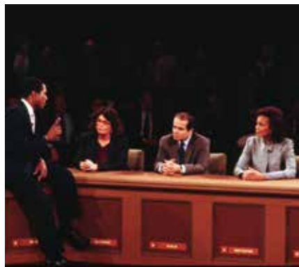
Public figures argue through ethical dilemmas.