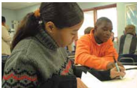
Mississippi students analyze problems associated with refugee camps in order to propose solutions.

This session explores problems of religious conflict and urban organization with a case study on Jerusalem as sacred space. It also looks at urban and agricultural use of scarce water resources by studying Egypt's Nile River. Classroom segments show students exploring the problems of refugee populations and engaging in a hands-on activity about the Nile River Delta. ▼