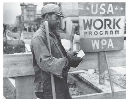
Works Progress Administration Worker Receiving Paycheck, 01/1939.

Farmers lured into producing massive food surpluses for WWI could no longer profit when the war ended and demand plummeted. After 1933, President Franklin D. Roosevelt sought to improve the conditions of farmers via policies in his New Deal plan. Later, the majority of government subsidies meant to help the struggling small farmer went to corporate agribusiness. The Freedom to Farm Bill of 1996 gave farmers a little more maneuverability, but for the most part farmers are still held to the fluctuating demand statuses of large competitive firms.