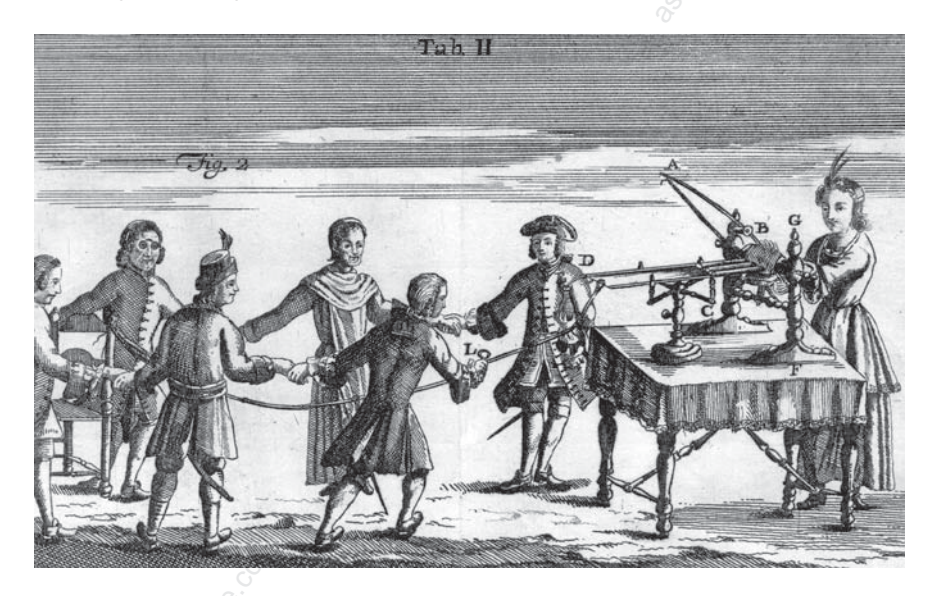
Figure 7.4 Plate from Petrus Joannes Windler's Tentamina de causa electricitatis (Naples, 1747).

It is likely that to eighteenth-century Neapolitan viewers the plates of Tentamina conveyed a message that modern viewers are only partially able to retrieve: if Della Torre's attempt to place himself at the centre of the scientific activities of Palazzo Tarsia is clear, the plates portrayed other protagonists that I have been unable to identify. Details such as the mustachios in the figure on the left in Figures 7.2 and 7.4 and the foreign costume of one of the people holding hands in Figure 7.4 must have been clear hints of who these people really were. The young woman, however, can confidently be identified as Della Torre's pupil, Mariangela Ardinghelli.