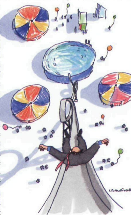
When professionals don't do their jobs perfectly, they zoom into a "doom loop."

Senior managers had identified six consultants whose performance they considered below standard. In