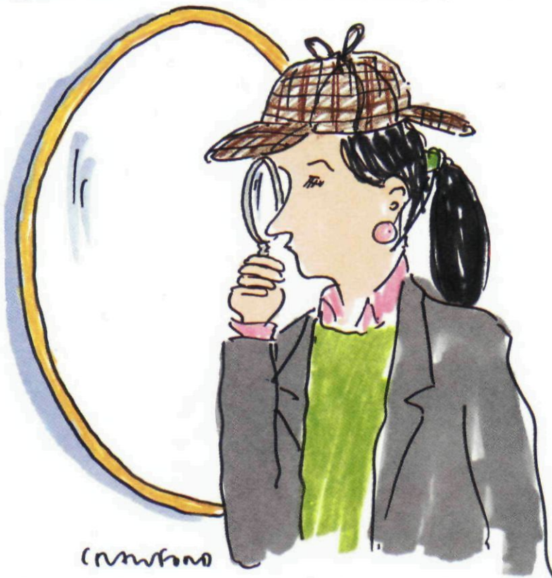
The professional who reasons productively casts a critical eye on her own role in a company's problem.

Manager: "Well, I certainly don't think you sound like you're whining. But two thoughts come to mind. If I understand you correctly, you were complaining, but the