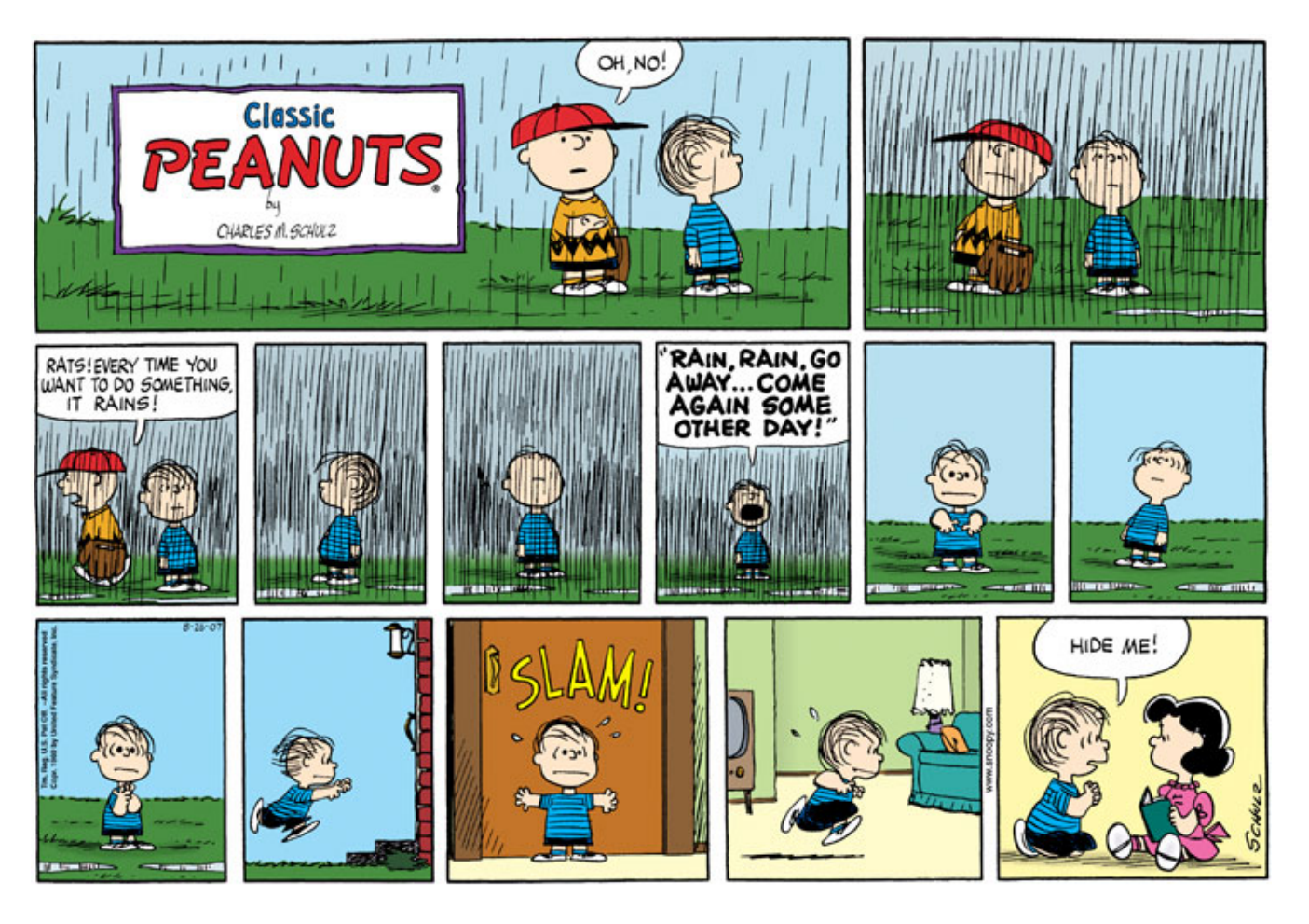
Permission to use these Peanuts comic strips is granted to SPiBR.org LLC by United Media.

"Our deepest fear is not that we are inadequate. Our deepest fear is that we are powerful beyond measure. It is our light , not our darkness that most frightens us. We ask ourselves, 'Who am I to be brilliant, gorgeous, talented, fabulous?' Actually, who are you not to be? You are a child of God. Your playing small does not serve the world. There is nothing enlightened about shrinking so that other people won't feel insecure around you. We are all meant to shine, as children do. We were born to make manifest the glory of God that is within us. It is not just in some of us; it is in everyone. And as we let our own light shine, we unconsciously give other people permission to do the same. As we are liberated from our own fear, our presence automatically liberates others."