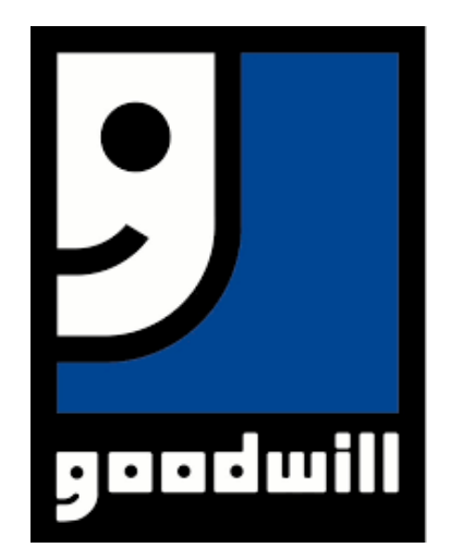
Goodwill Industries of Northern Wisconsin and Upper Michigan