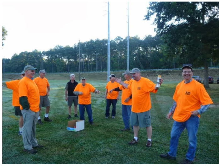
2013 Coosa V Chili Cook-off Crew

So there's your siren's song, in case you needed coaxing. Plenty of fish, including some big boys, no one around, and weather that's just not too hot or too cold but just right. Sounds like a reason to get some fresh air. Not that you needed the excuse.