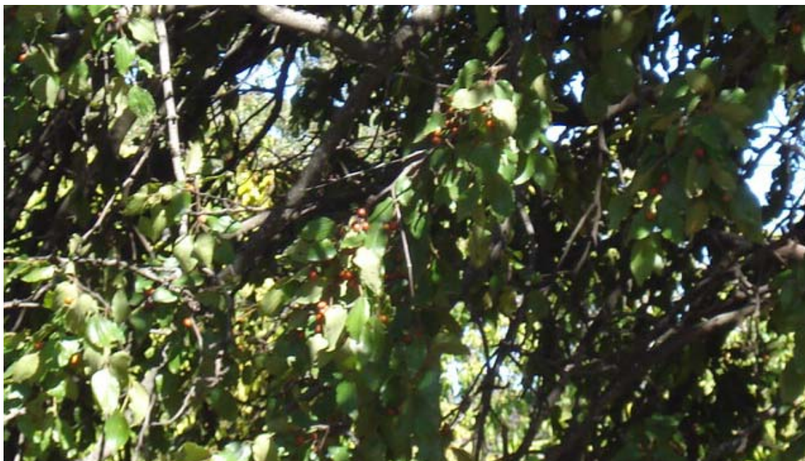
Ziziphus mucronata can treat a wide range of ailments based traditional knowledge