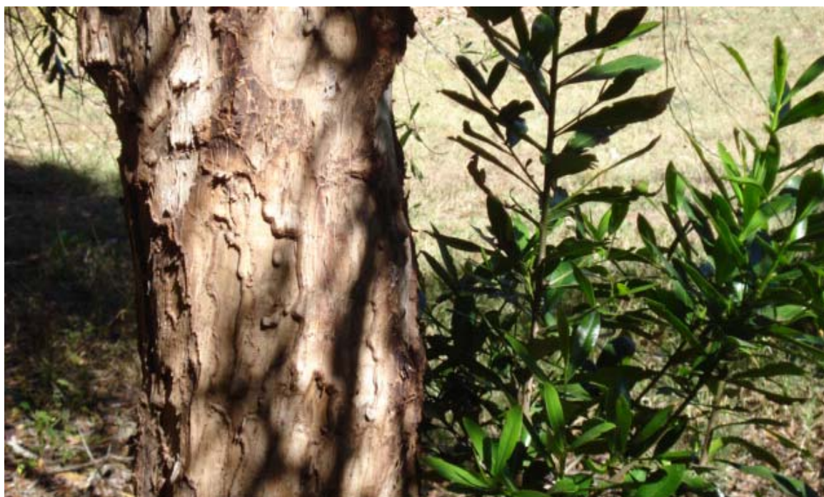
Ring barked Warburgia salutaris with shoots coming out

Despite the foregoing realities, the degree of threat to key medicinal plant species has not been established although a preliminary categorization of such species (by threat category) has been done for four districts in Zimbabwe (MET, 2008). There is therefore need for national assessments of threats to medicinal plant species using internationally recognized