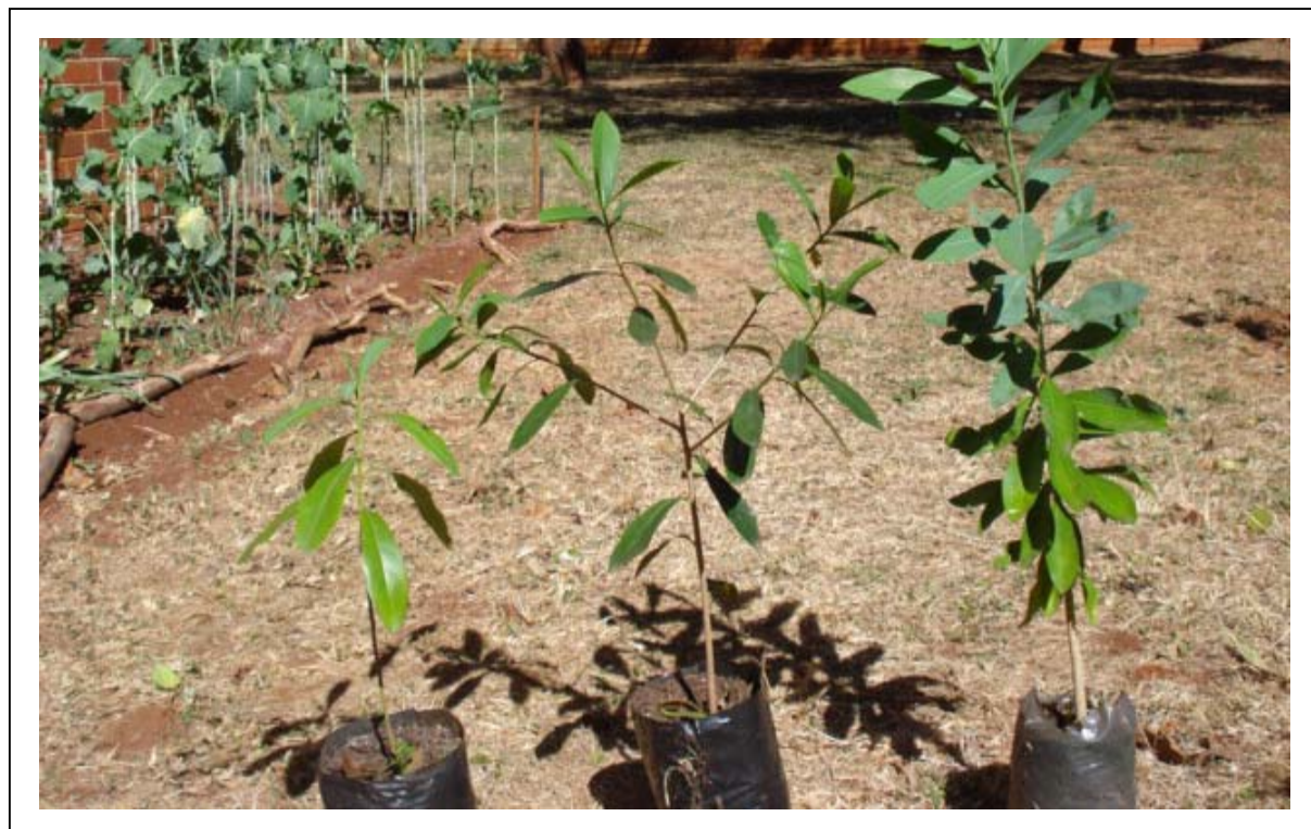
Propagation of Warbugia salutaris