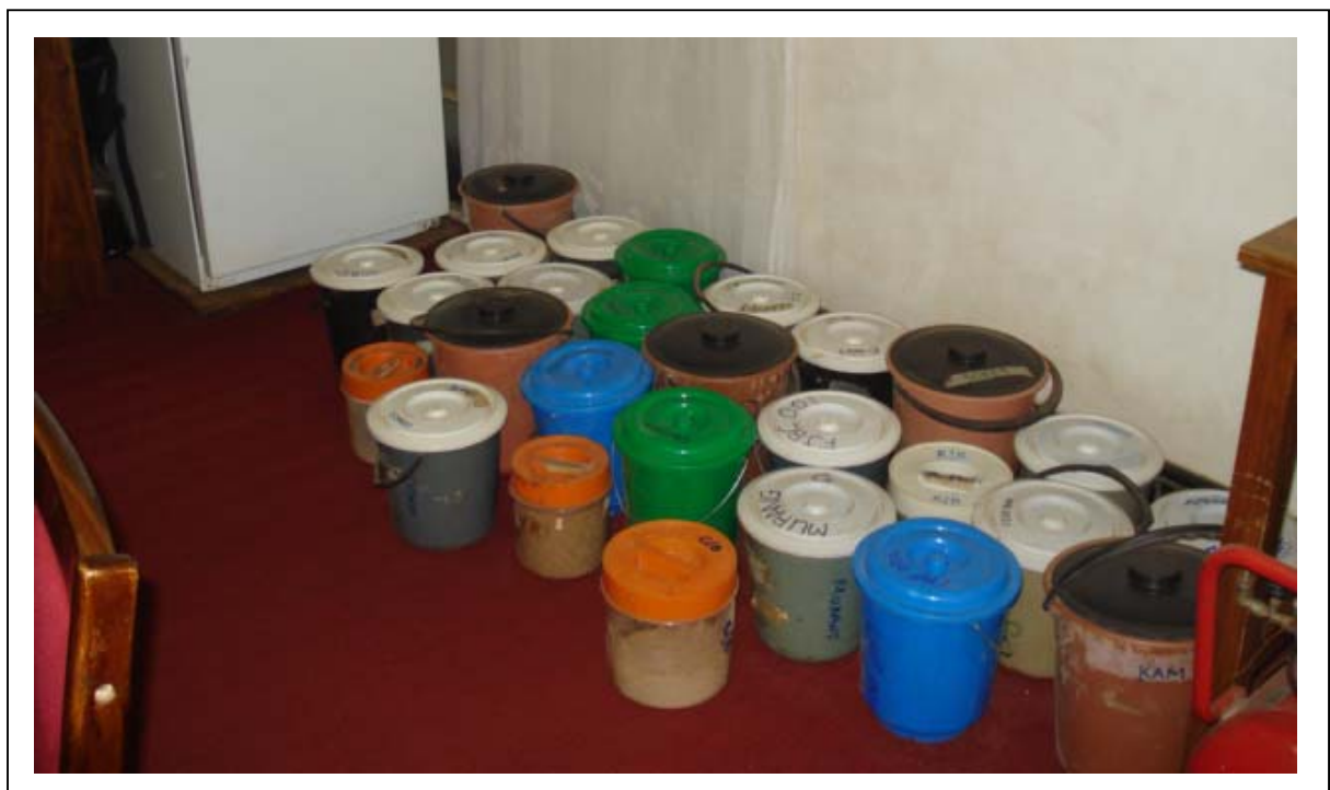
There is a trend towards improved processing and packaging of traditional medicinal plants