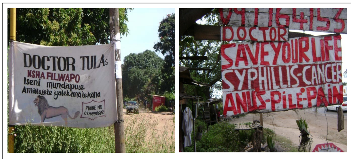
Traditional healers advertising their trade along the roadside