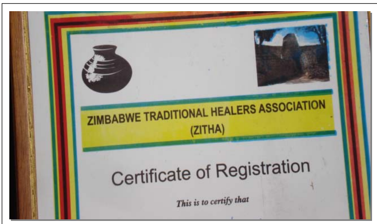
Sample of membership certificate for traditional medical practitioners in Zimbabwe