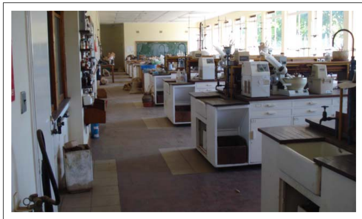
Research facilities at the University of Zimbabwe