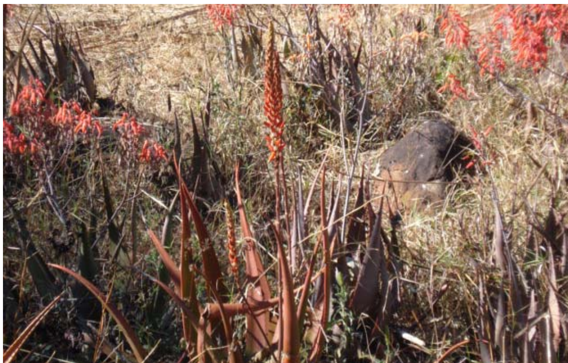
Traditional harvesting of the Aloe species involves removing of the whole plant

Other attempts to reduce threats to medicinal plants by study countries include the following: