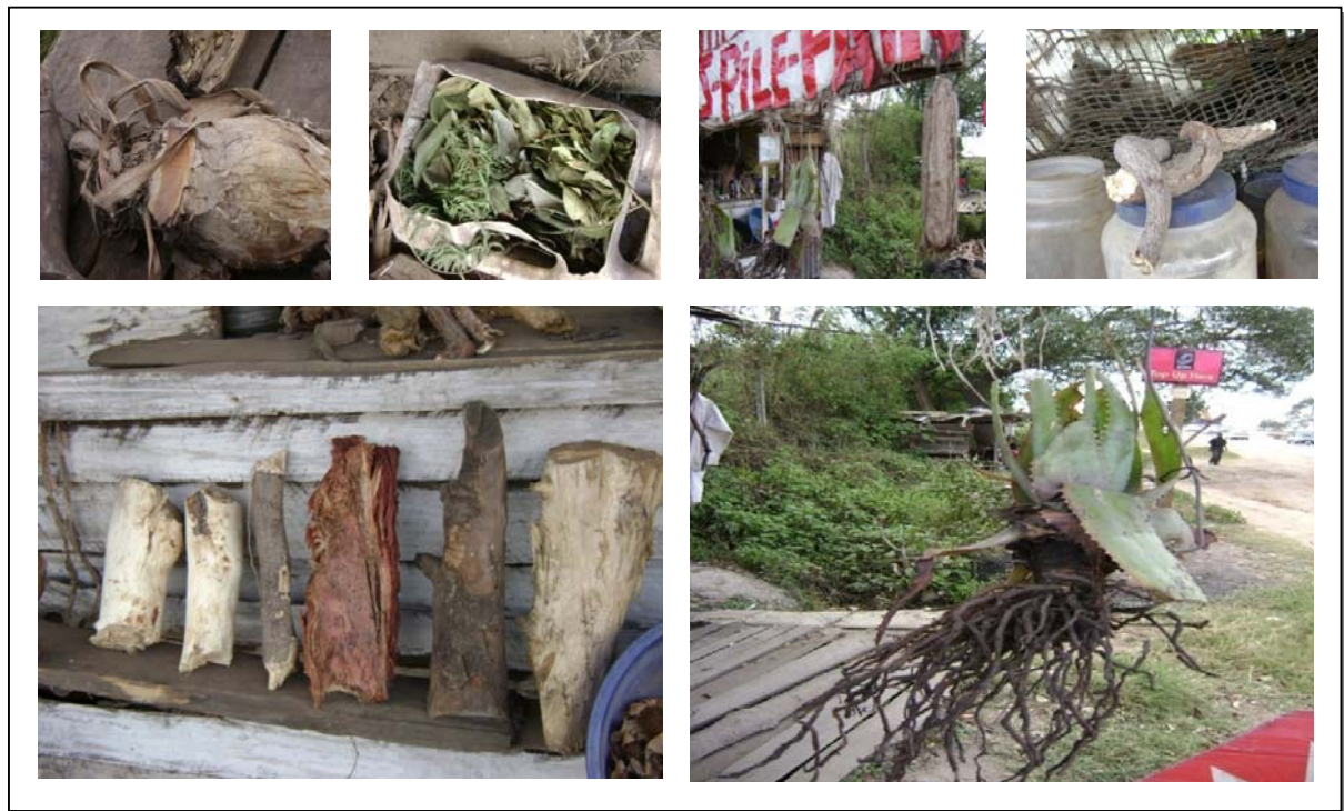
Presentation of traditional remedies with no special packaging