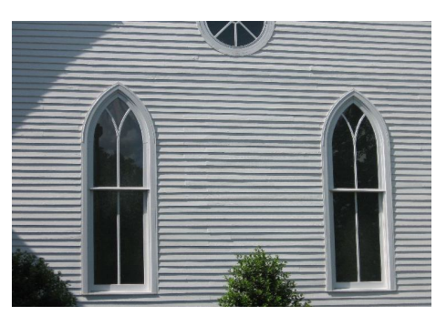
The windows of the historic Green Level Baptist Church are characteristic of the Gothic Revival style.