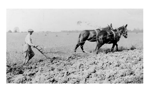
Wake County farmer plowing fields in the 1930s.