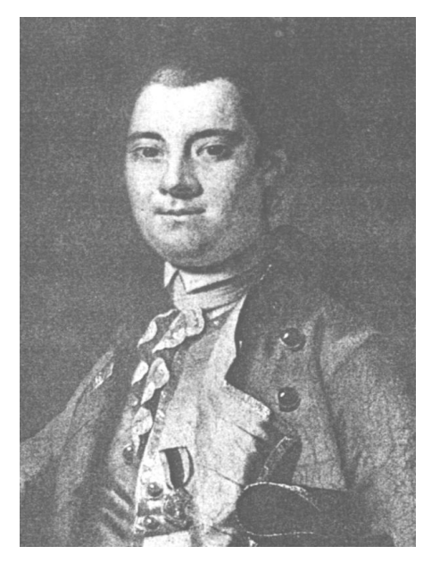
Royal Governor William Tryon.