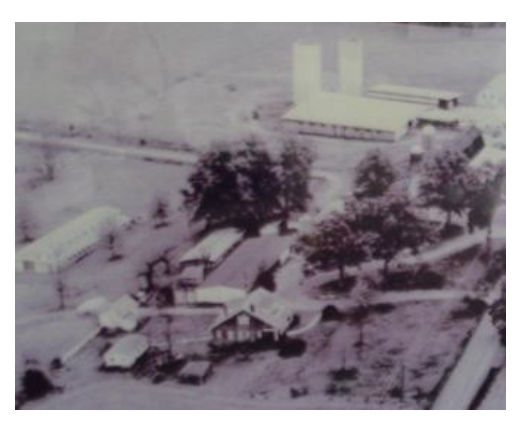
Aerial shot of Kildaire Farm before development.

In addition to controlling development, the town was eager to preserve green space and recreational areas. With this in mind, the Land Dedication Ordinance of 1974 required de-