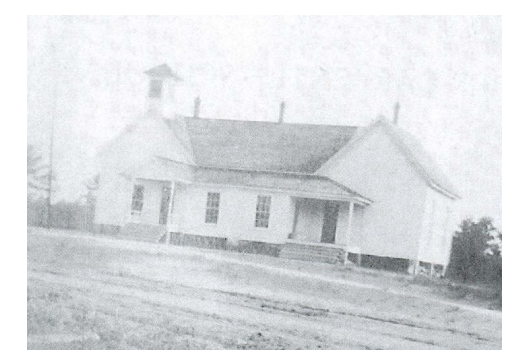
Schoolhouse in Carpenter