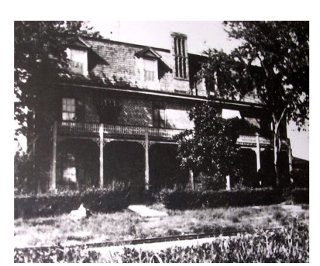
This historic photo (ca. 1914) of the Page-Walker Hotel depicts its original design and two-story porch on the main façade.