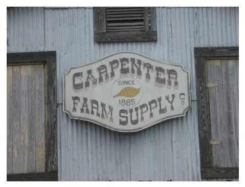
The Carpenter Historic District retains many aspects of its turn-of-the-century agricultural heritage such as the Carpenter Farm Supply Store.

Although the railroad and many businesses left during the Depression, the Carpenter community continued to endure primarily because of tobacco. Western Wake, southern Durham and eastern Chatham Counties were full of tobacco fields. These tobacco farmers looked to Carpenter for supplies and repair shops. In the 1930s, lumber became important in Carpenter as well. The Chandler Lumber Company opened in 1933 and produced 100,000 board feet per day at its peak. The Russell sawmill company was established in 1935. Both operated until 1960.<sup>59</sup> The roads in Carpenter were paved in the late 1940s and early 1950s. The majority of Carpenter is now within Cary's town limits. About 250 acres of the Carpenter Community were listed on the National Register of Historic Places in 2000 as the Carpenter National Register Historic District. The National Register District comprises the commercial crossroads buildings including the general stores and warehouses, nearby residences, Good Hope Church and cemetery, and seven complete farmsteads.