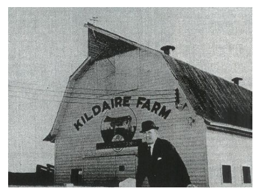
Historic Kildaire Farm barn.