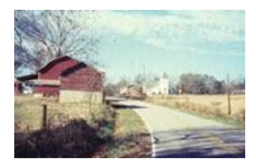
Green Level is one of the last expansive rural landscapes in the Triangle area.