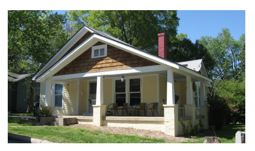
Subdivisions in the early 20th century led to construction of Bungalow style dwellings at 302 Wood Street (above) and 305 S. Walker Street (below).

As residents began looking to Raleigh for retail needs, local businesses started catering to passing highway traffic. Western Wake Highway turned into East Chatham Street as it entered Cary, and most businesses migrated there. Gas stations, garages and restaurants all thrived along the highway. Other businesses which did well in Cary were those servicing the farming community. By 1930, Cary had a gristmill, fertilizer dealership, building supply firm, and a cotton gin. Changes were also occurring in agriculture: during the 1920s, the boll weevil destroyed cotton farming in the area, and tobacco became the primary cash crop.<sup>30</sup>