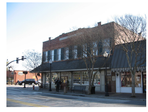
Built in 1931, the Ashworth Drugs building in downtown Cary was originally built as a Masonic Lodge.

Like elsewhere in the United States, the Depression hit Cary hard. The Bank of Cary failed on June 10, 1931. By October 1932, the town was bankrupt due to poor management and bookkeeping. Cary went through four mayors in two years during the mid-1930s, and in 1937 the mayor, the town clerk, and the police chief all resigned.