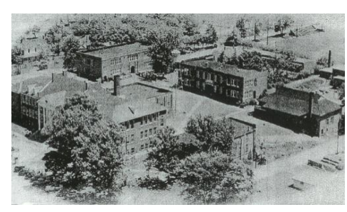
This photo depicts the campus of the former Cary High School in 1957-58.