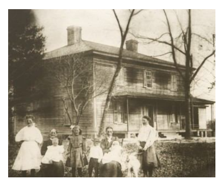
The Maynard-Stone House (ca. 1860) was recently relocated to allow for development at its original site.

lina. The day after Blair's troops entered Cary, emancipated local slaves left for Raleigh. Some enlisted with the Union Army and formed the 135<sup>th</sup> U.S. Colored Troops. The Union Army remained in Cary off and on until April 27<sup>th</sup> when an acceptable surrender agreement was signed by Confederate General Johnston.<sup>11</sup>