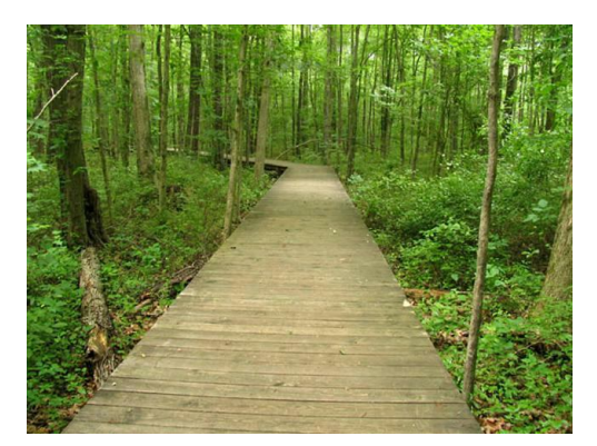
The Hemlock Bluffs Nature Preserve was purchased in 1976 and features a rare stand of Eastern Hemlock trees.