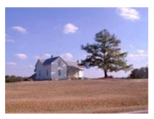
This late nineteenth-century farmhouse is located at 8700 Green Level-Upchurch Road