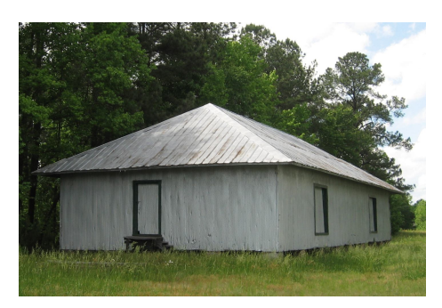
Ca. 1930 storage building in Carpenter.