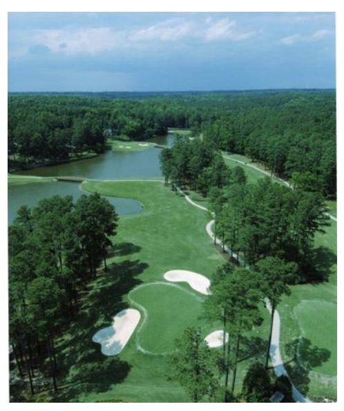
In the 1960s, the development of MacGregor Downs added a golf course to the amenities of the town.