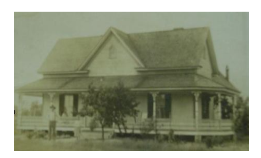
The Barbee-Williams farmhouse (ca. 1900), formerly located on Morrisville-Carpenter Road, was lost to development ca. 2000.

The 21<sup>st</sup> century has seen the Town's expansion to the west. Cary's boundaries are slowly encompassing two small rural communities that have noteworthy histories of their own: the crossroads communities of Carpenter and Green Level.