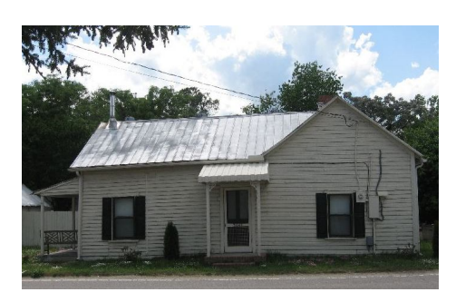
This structure at 3041 Carpenter-Upchurch Road was built in the late nineteenth century as a boarding house for railroad and other workers.