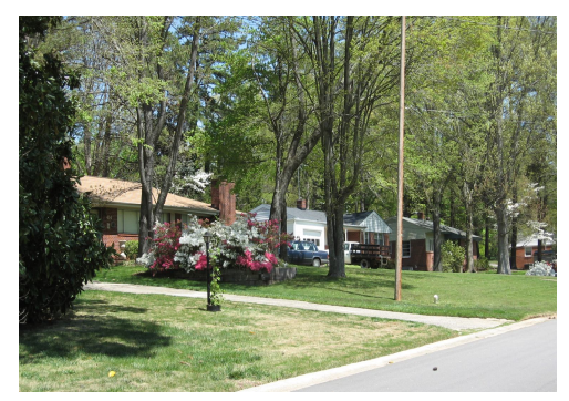
Cary's residential areas expanded in the 1950s through developments such as the Russell Hills Extension which included properties along Ann Street.