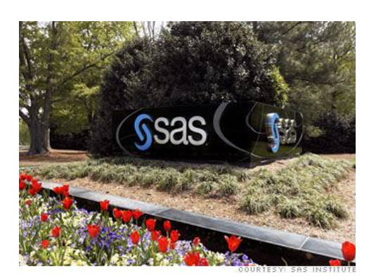
The SAS complex boasts a 900-acre campus in the north section of Cary.

velopers to donate one acre of land to the town for every 35 housing units constructed – or pay a fee. With the explosive rate of growth, nearly 460 acres had been donated by 1994. Beginning in the 1970s, more greenways -- modeled after the 10 miles of greenway at Kildaire Farms -- were constructed using both private and public funding. The State of North Carolina purchased 85 acres of land along Swift Creek in southern Cary in 1976 because it contained a system of north-facing bluffs that supports a community of Canadian hemlocks and other vegetation unusual to this area. The State classified the hemlock bluffs as a state nature and historic preserve. In 1983, the Town obtained a long-term lease on the state-owned tract for the purpose of developing and managing it as the Hemlock Bluffs Nature Preserve. (Through subsequent land donations and land dedications required of adjacent subdivision developers, the Preserve currently comprises 150 acres.) A master plan for the town park system was adopted in 1978.<sup>47</sup>