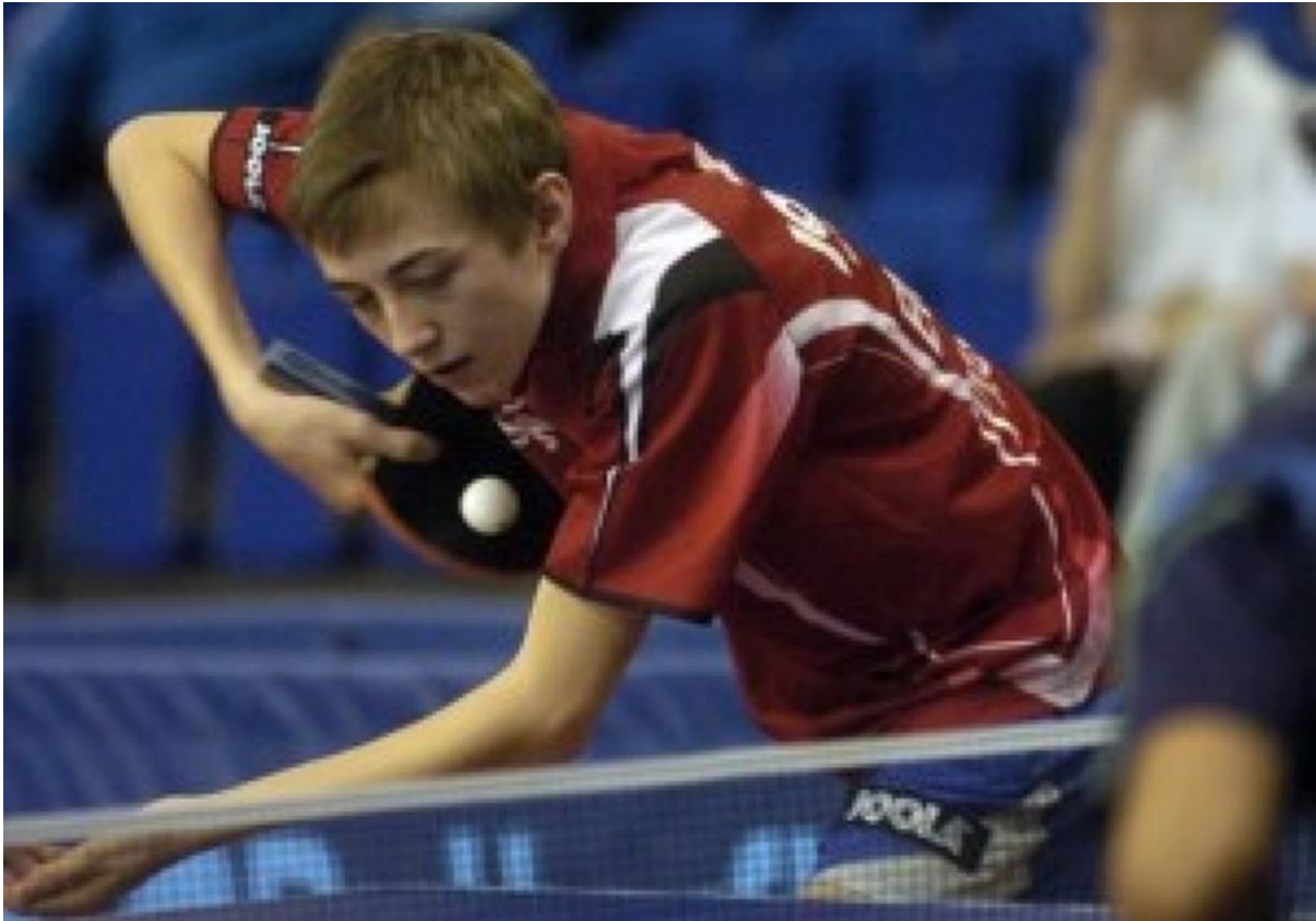
Table tennis, also called ping pong, is a sport that originated in the Victorian period in England. High-class people used to play table tennis after dinner. It was initially played by stacking books at the center of a table and hitting a golf ball with thick books. Table tennis needs a lot of attention and speed.

Professional table tennis is played on a hard table which is divided by a net. Players stand opposite to each other, and hit a lightweight ball with a small round bat across the table. Spinning the ball makes the chances of hitting the ball a lot less. So, players tend to spin the ball before serving it to the opponent.