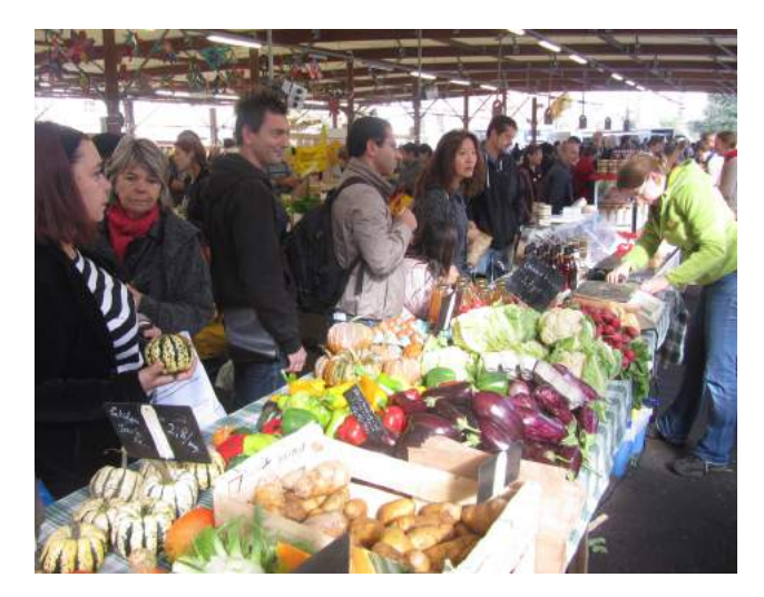
Producers' market, France. Campagnes Solidaires'

European citizens are already building alternative food systems, finding a myriad of ways to break down the dominance of large agribusinesses in the food chain. Farmers, environmental groups, social justice organisations, workers unions, consumer groups and other organizations are constructing alternatives to the current model and organizing for change.