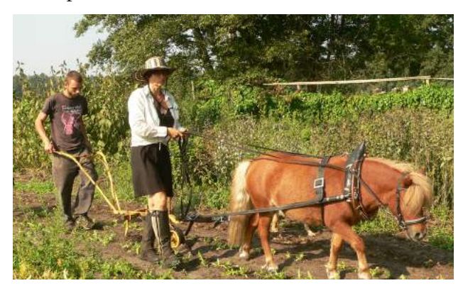
Bienenwerder: Collective farming in Germany.

Farming should be a respected profession where farmers can ensure a living from their production in a thriving rural environment – vital in order to make farming attractive for new entrants. This means changes in how we teach agriculture and to the functioning of state research, development and training bodies, as well as broader support for rural social and economic development.