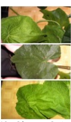
Algodón morado (Cotton)