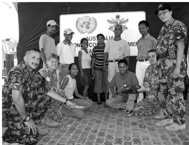
Australian Civil-Military Team in East Timor

counterinsurgency is inter-agency. And everything important—from policing to intelligence to civil-military operations to trash collection—will involve your company working with civilian actors and local indigenous partners you cannot control, but whose success is essential for yours. Train the company in inter-agency operations—get a briefing from the State Department, aid agencies and the local Police or Fire Brigade. Train point-men in each squad to deal with the inter-agency. Realize that civilians find rifles, helmets and body armor intimidating. Learn how not to scare them. Ask others who come from that country or culture about your ideas. See it through the eyes of a civilian who knows nothing about the military.