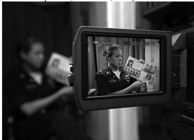
Remember the global audience

16. Practise deterrent patrolling. Establish patrolling methods that deter the enemy from attacking you. Often our patrolling approach seems designed to provoke, then defeat, enemy attacks.