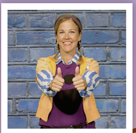
for he is good."