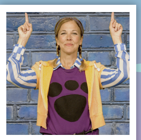
to the Lord