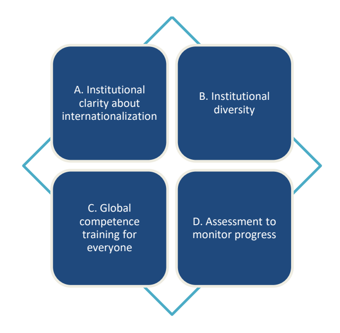
Figure 2. Institutional strategies for global competence development

Institutional management plays an import role for internationalization and global competence development. The management is responsible for the overall vision and its achievement, and has to make sure the institutions individual parts work together towards comprehensive internationalization. Overall, its responsibilities can be differentiated into four interdependent categories, namely, institutional clarity about internationalization, assessment to monitor progress, institutional diversity, and global competence training for everyone (see Figure 2). The following pages will explain these categories in more detail, and provide some tips and recommendations for how to improve on the individual aspects and get the most out of institutional strategy.