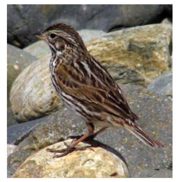
Figure 3. The Belding Sparrow is promoted to full species status in the reference guide.