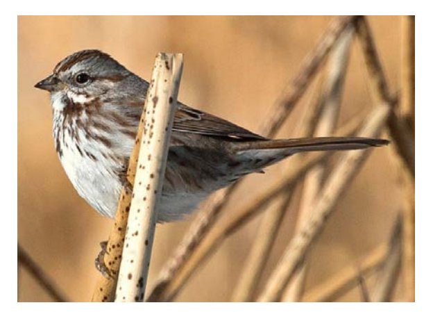
Figure 2. The numerous subspecies of Song Sparrow, including the breeding fallux of Arizona, are described in the book.

As a reference guide, this book superbly cites annotations for each species in the notes section at the back of the book. The index cites historical and modern ornithologists, as well as birds by name. For the sparrow enthusiast, the Peterson Reference Guide to Sparrows of North America is a complementary book, lush with information not easily or likely found in other resources. For an ornithological history buff, this book weaves tales of taxonomic discovery.