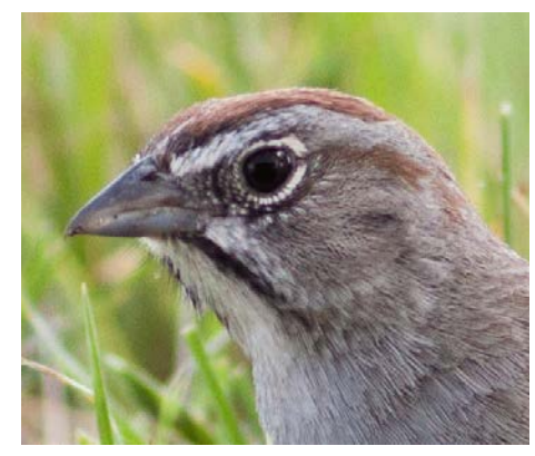
Figure 1. A Rufous-crowned Sparrow with relatively finer markings and an eye-ring usually only broken by the post-ocular stripe.