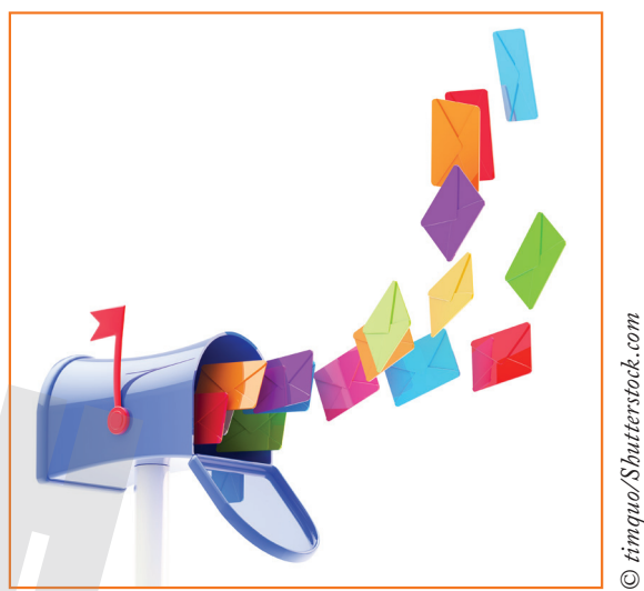
FIGURE 9-1: FORM LETTERS

Some letters are developed and sent as e-mail letters, and some are sent as attachments to e-mail messages. Still others are transmitted through fax machines. Keep in mind, however, that sending hardcopy letters on company letterhead is the preferred approach, whether you are communicating with external or internal audiences. Some of this has to do with tradition, some with the formal statement that letters make, and some with the realization that e-mail can be easily hacked, raising privacy and security concerns.