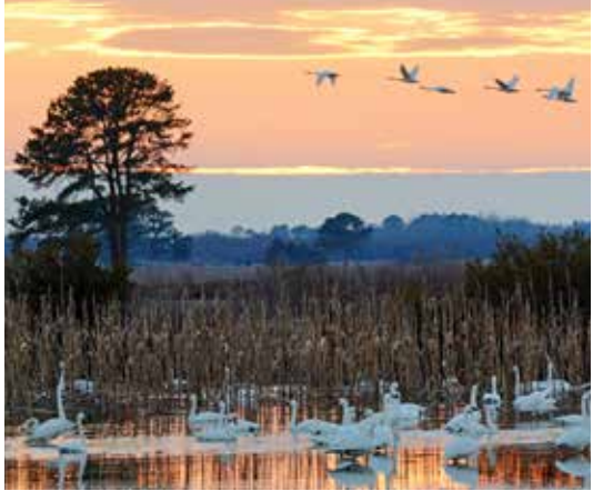
Berms and water control structures reduce wildfire risk under a warmer climate by keeping pocosin bogs wet, which will benefit a diversity of wildlife species.