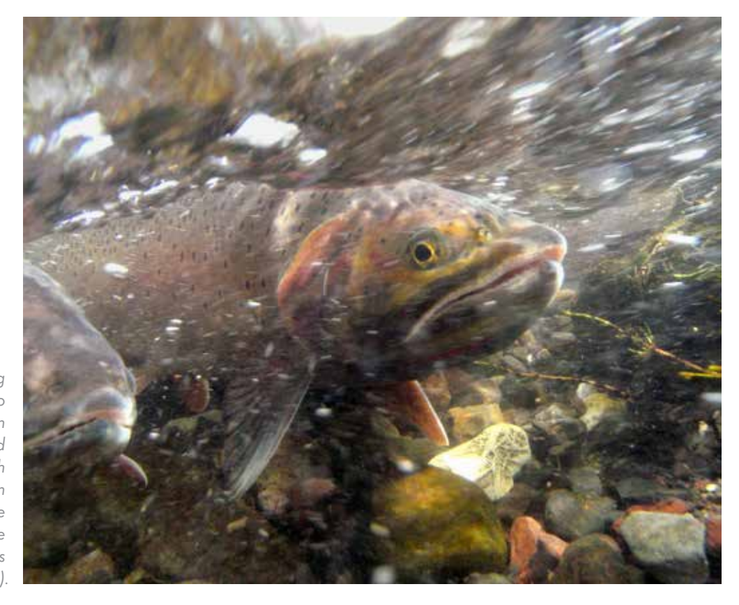
One strategy for conserving cold-adapted native fish is to re-connect low elevation streams that may warm beyond optimal temperatures with much colder, high elevation tributaries that may see improved conditions as the climate warms (Credit: M. Haring).

Some low elevation streams in the Madison River Valley of southwest Montana are expected to warm beyond optimal thresholds for native trout and other aquatic organisms adapted to cold-water steams. Meanwhile, conditions in higher elevation tributaries that are currently too cold to support native trout, are likely to improve as the climate warms. The Greater Yellowstone Coalition, State of Montana, and the US Forest Service are helping native trout and other species access these higher elevation streams by removing fish passage barriers, improving riparian vegetation, and securing in-stream flow rights.