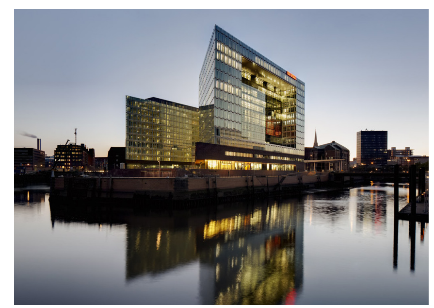
Spiegel Verlag's headquarters in Hamburg's HafenCity.

Week after week, more than 14 million people choose to engage with the content developed by the Spiegel group. Because their flagship publication, Der Spiegel, is published on a weekly basis, digital assets are only critical for a few days. The group wanted to implement an active archive strategy to protect videos and editorial content by creating a third copy of their digital assets in a user-accessible storage repository. An active archive intelligently monitors and migrates data across multiple storage devices, reduces recall time of an archive file and monitors the integrity of digital assets to eliminate the risk of loss from bit rot, corruption, failed technology or bad media. This strategy provides virtually limitless storage capacities in a much smaller footprint and cost per gigabyte.