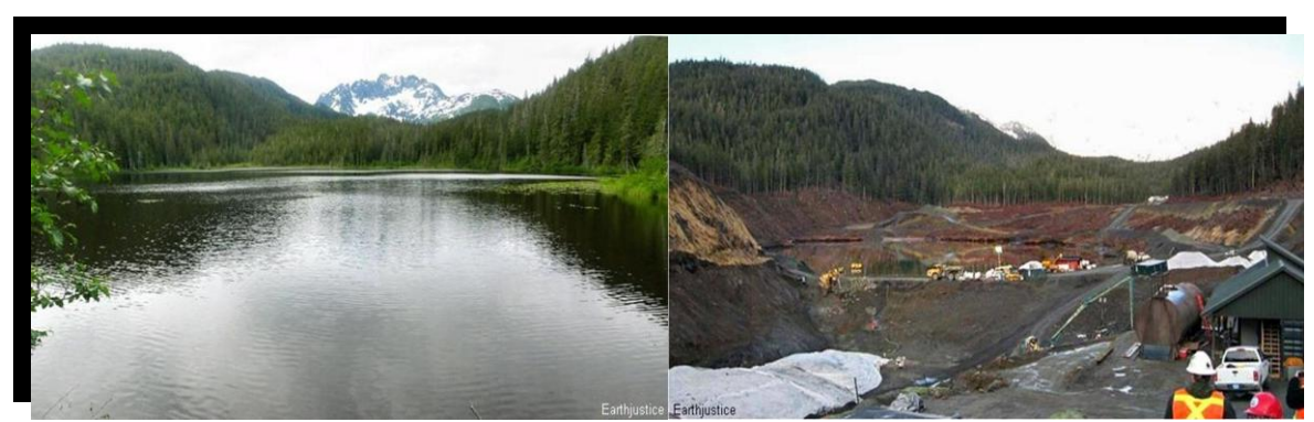
Lower Slate Lake Before and After

authorized the disposal of mining waste from the Kensington Mine in the Lower Slate Lake in Alaska. As noted above, when EPA issues Section 402 permits, the permits often include limits on pollution discharges based on technology-based and water quality based standards. Those limits are not included in Section 404 permits that the Corps issues. The controversy arose in the Kensington Mine case because EPA had developed technology-based pollution limits that would have significantly limited or precluded Coeur from disposing of its mining waste in the Lower Slate Lake if Coeur were required to obtain a Section 402 permit. However, since Coeur was not required to obtain a Section 402 permit, the EPA standards did not apply to Coeur's disposal of waste in the Lake, but did apply to any pollution that was released from the Lake. The Southeast Alaska Conservation Council, a local environmental group, challenged the permit, arguing that the Corps lacked authority under the Clean Water Act to issue the Section 404 permit and that the permit should have been issued by EPA under Section 402.