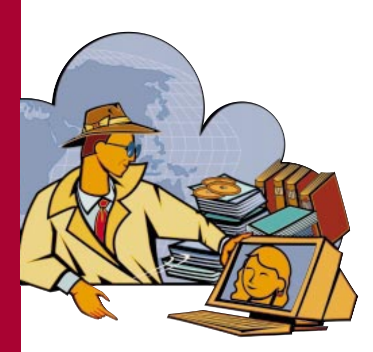
With a Head-Start Solution Set for Fraud Management, you can quickly protect your business now and be ready for future growth.

Wireless fraud poses a serious threat to the mobile telephony industry. But until recently, only the largest providers could afford to deploy advanced fraud management capabilities. Now DIGITAL "levels the playing field." Our Head-Start Solution Sets for Fraud Management enable small and medium-sized providers to implement a powerful fraud solution quickly, with minimal risk, and at a highly competitive cost.